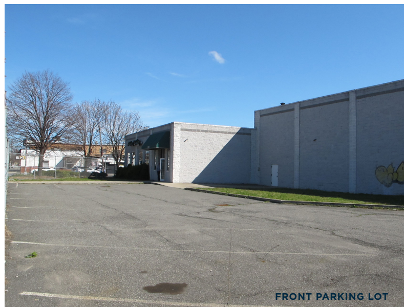
FRONT PARKING LOT