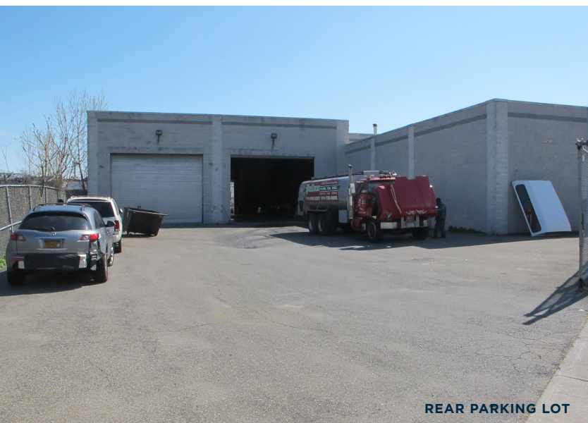
REAR PARKING LOT