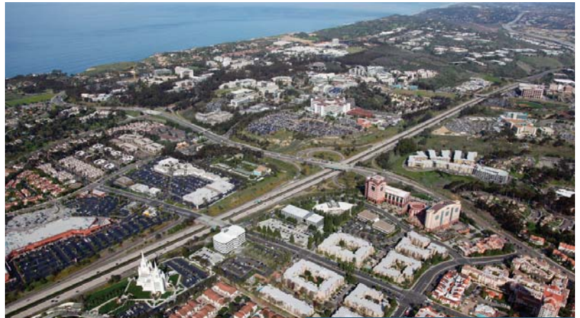
IDEALLY LOCATED IN SEASIDE LA JOLLA

FOR LEASING INFORMATION, CALL 858.677.7960 4365 EXECUTIVE DRIVE, SUITE 100, SAN DIEGO, CA 92121