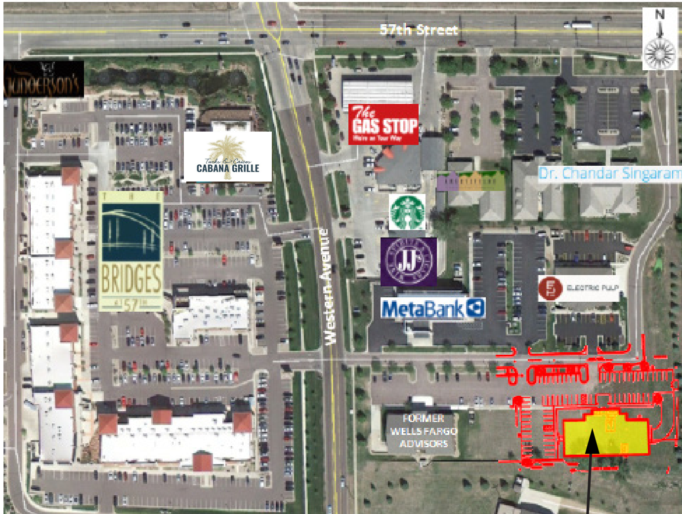
DAVIS PROFESSIONAL BUILDING

4910 S Isabel Drive Sioux Falls, SD 57108