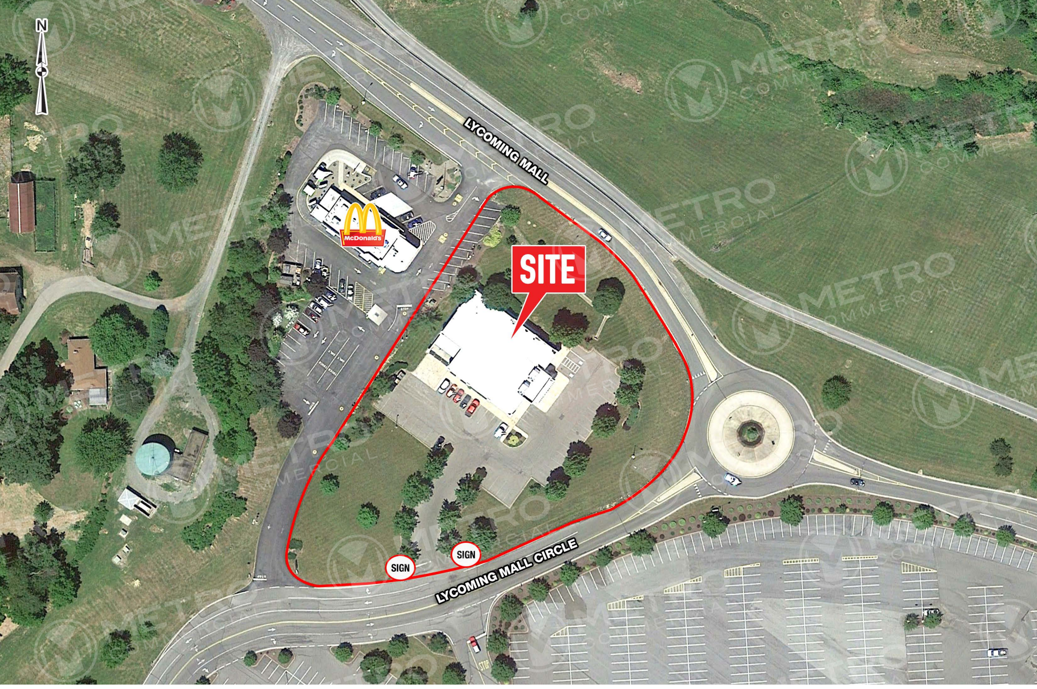
The information and images contained herein are from sources deemed reliable. However, Metro Commercial Real Estate, Inc. makes no representation whatsoever as to their accuracy or authenticity. Images shown may be modified for illustrative purposes. Images may be out-of-date and not current. 5.31.1