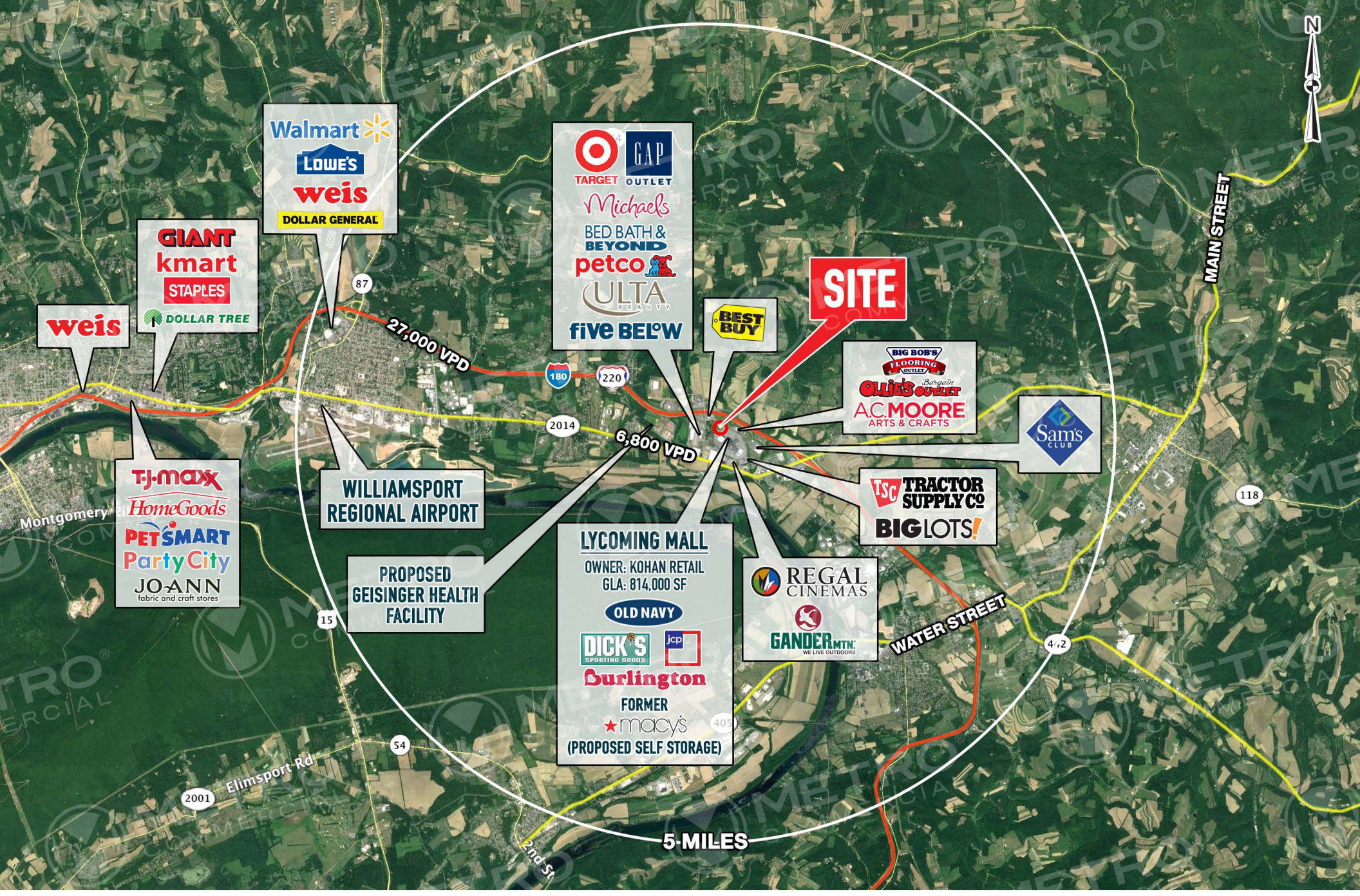
The information and images contained herein are from sources deemed reliable. However, Metro Commercial Real Estate, Inc. makes no representation whatsoever as to their accuracy or authenticity. Images shown may be modified for illustrative purposes. Images may be out-of-date and not current. 5.3