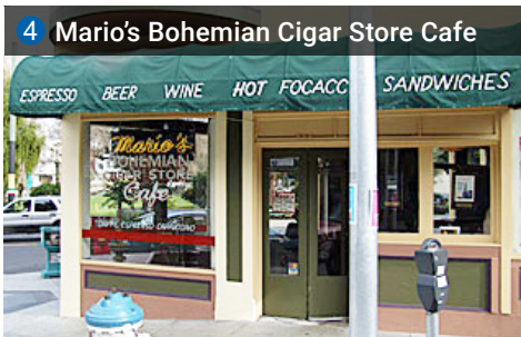
4 Mario's Bohemian Cigar Store Cafe