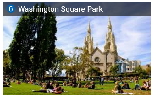
6 Washington Square Park