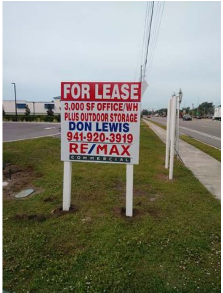
4724 53rd Ave E Sign