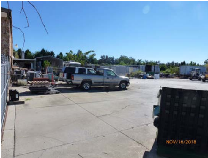
Outside Storage Area