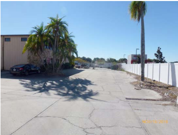
Access from SR 70 E