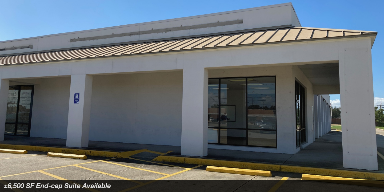
±6,500 SF End-cap Suite Available