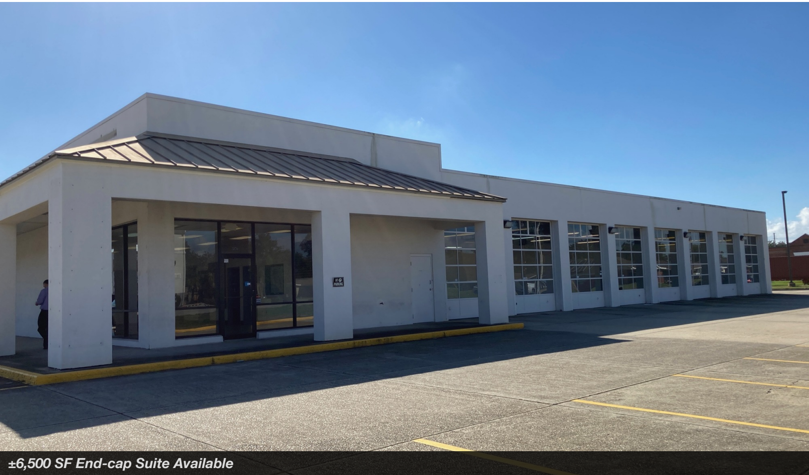
±6,500 SF End-cap Suite Available