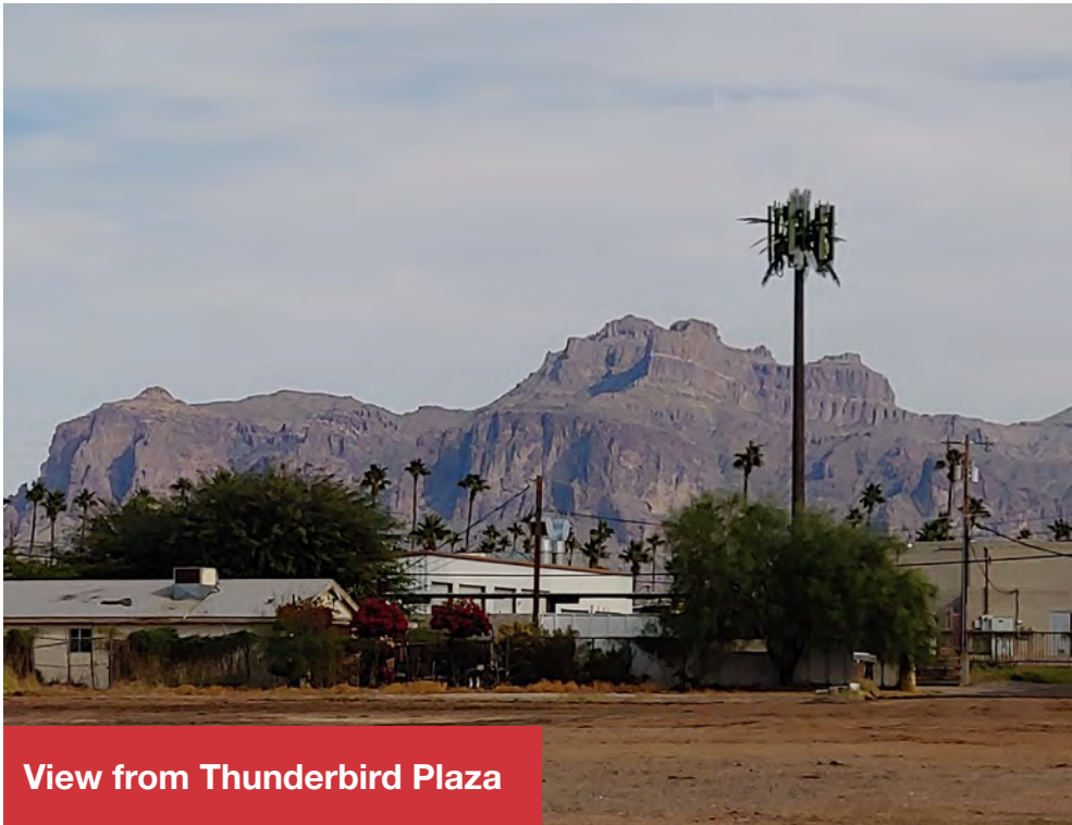
View from Thunderbird Plaza