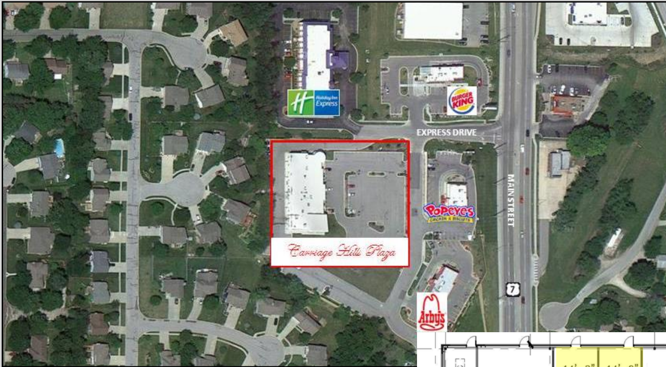
Carriage Hills Plaza