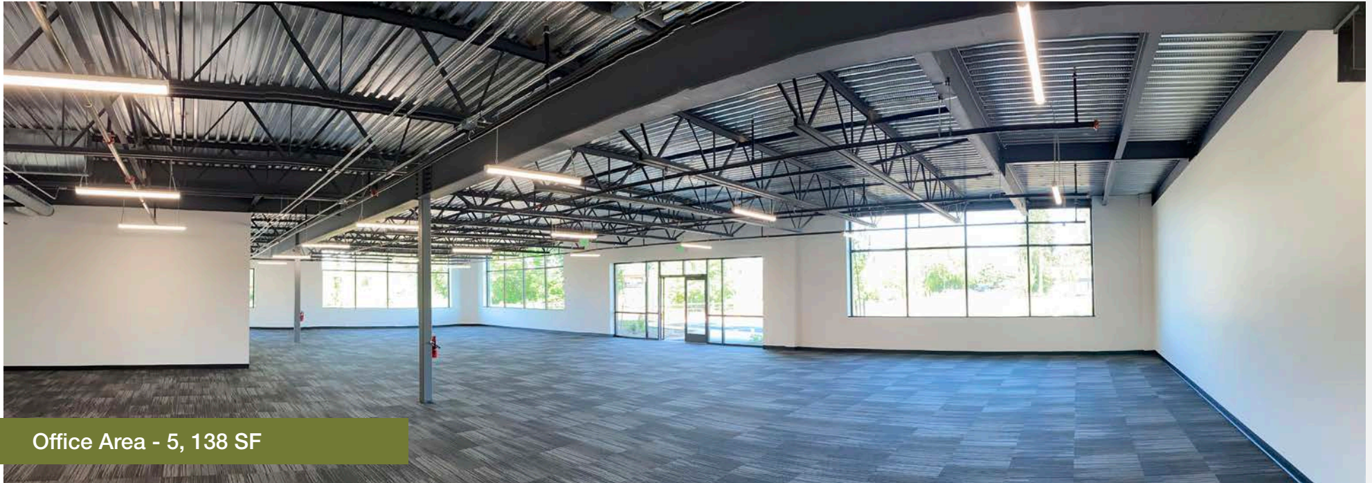
Office Area - 5, 138 SF