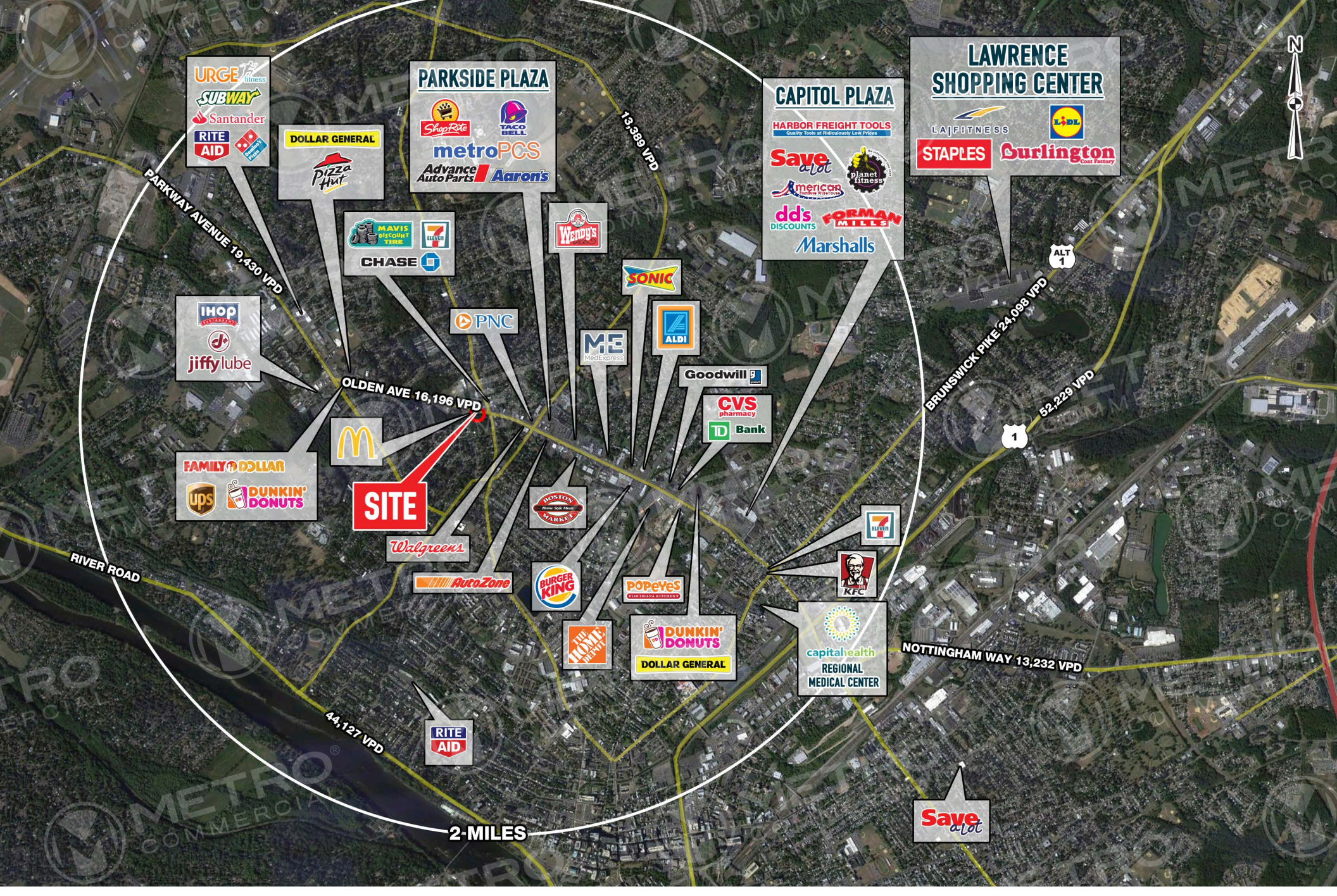
The information and images contained herein are from sources deemed reliable. However, Metro Commercial Real Estate, Inc. makes no representation whatsoever as to their accuracy or authenticity. Images shown may be modified for illustrative purposes. Images may be out-of-date and not current. 11.26.