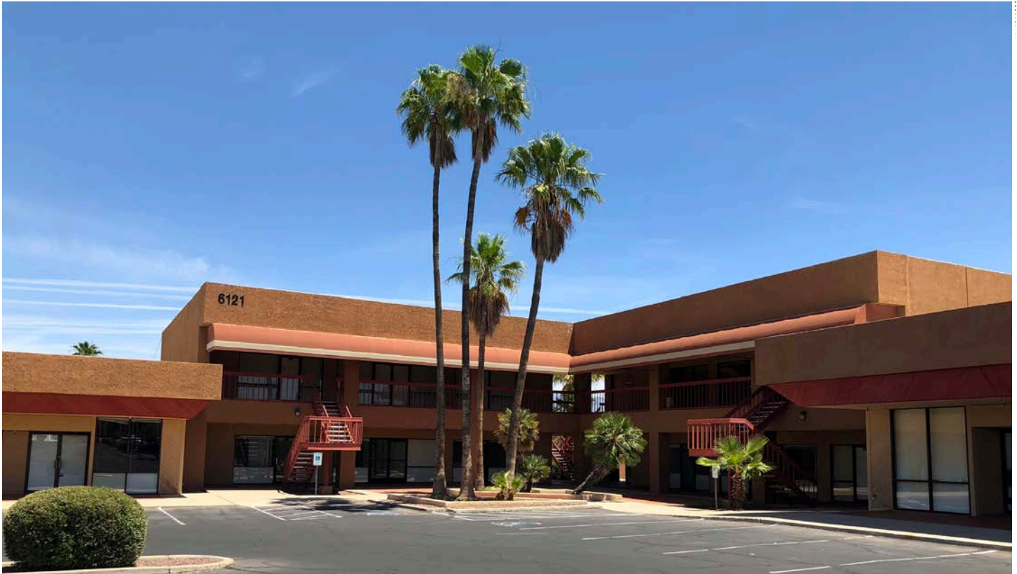
Exterior photos of existing \pm 29,745 SF "U"-shaped buildings