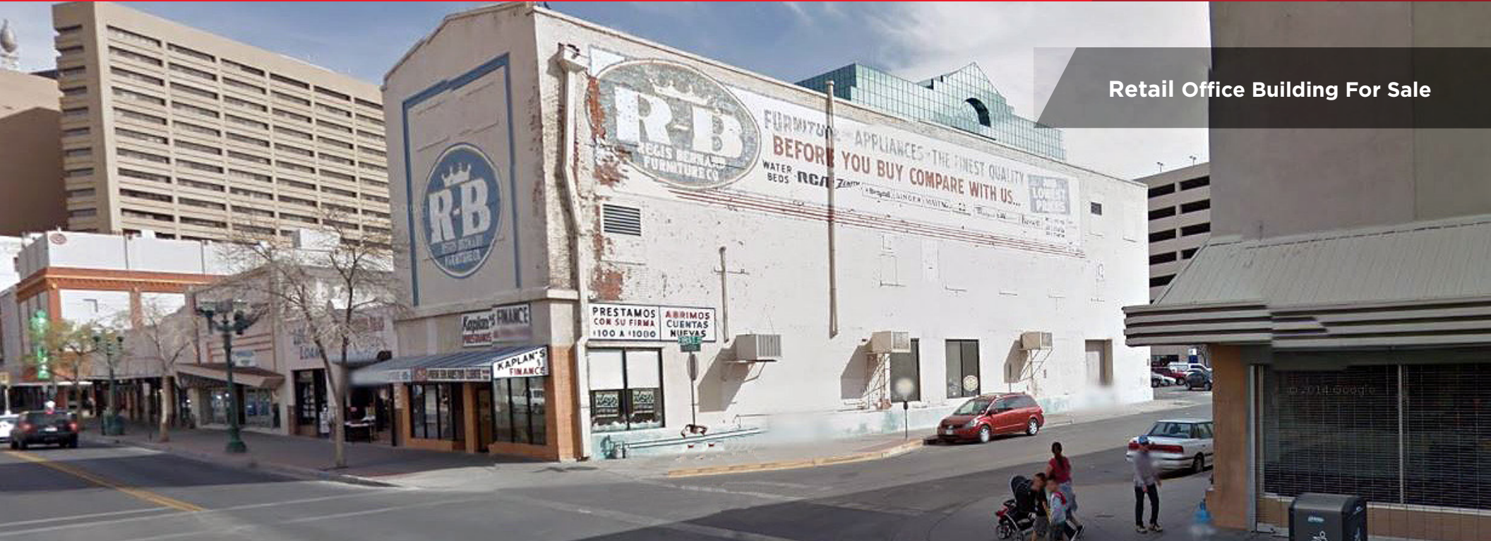
Retail Office Building For Sale