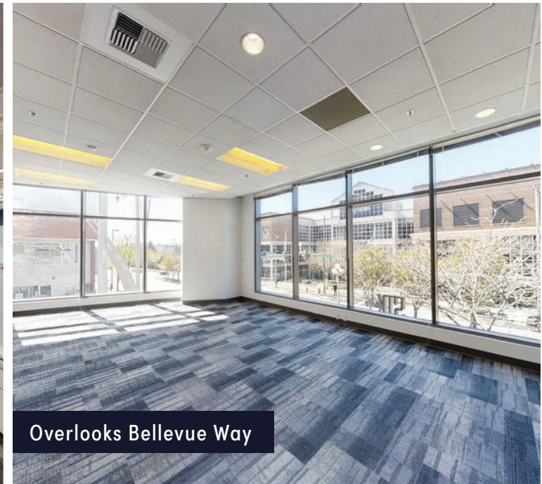
Overlooks Bellevue Way