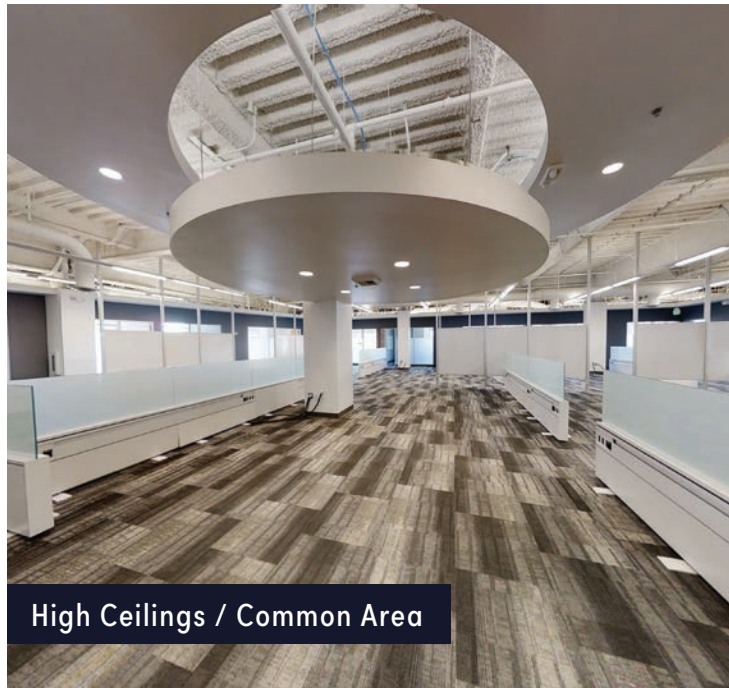
High Ceilings / Common Area