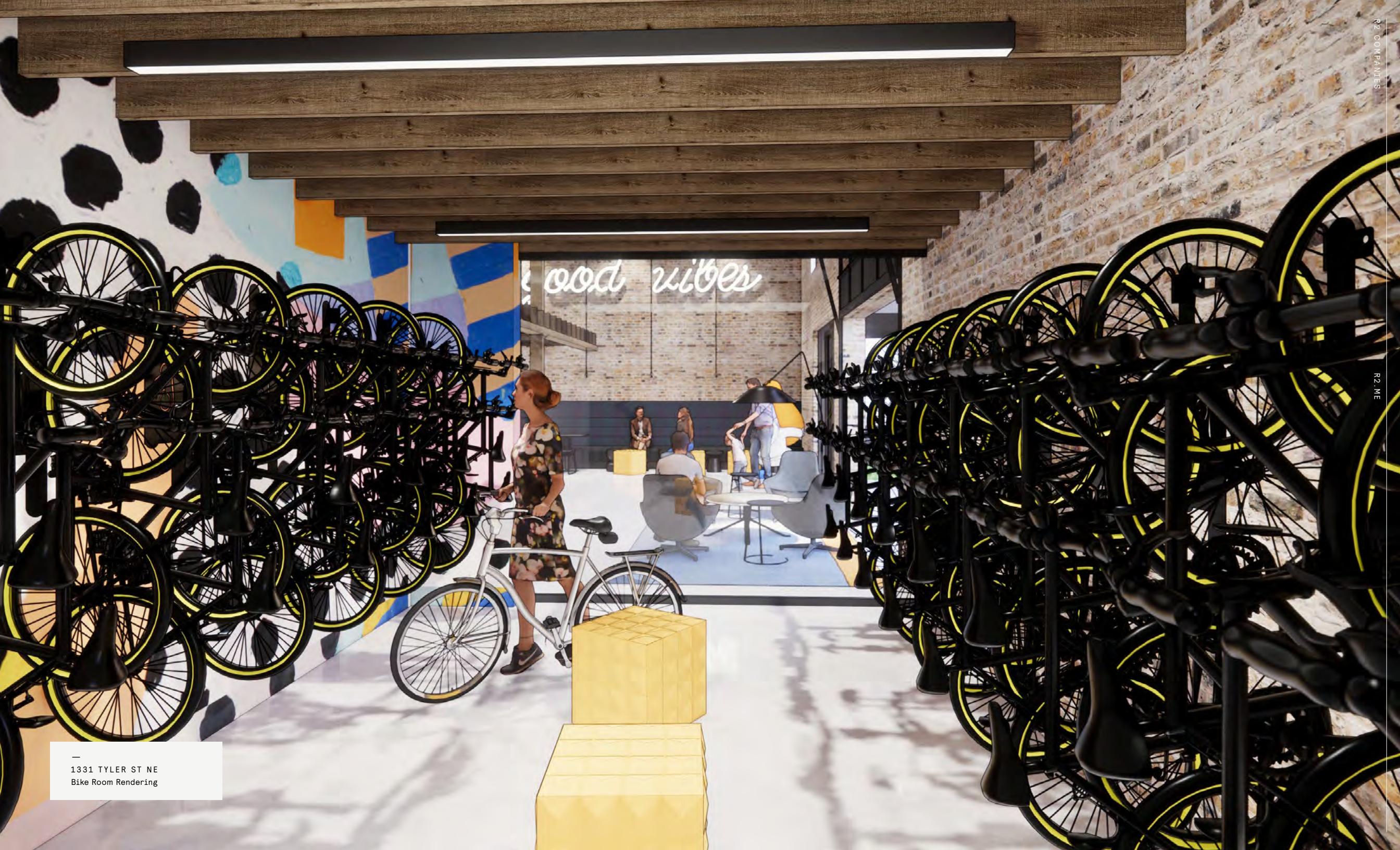
— 1331 TYLER ST NE Bike Room Rendering