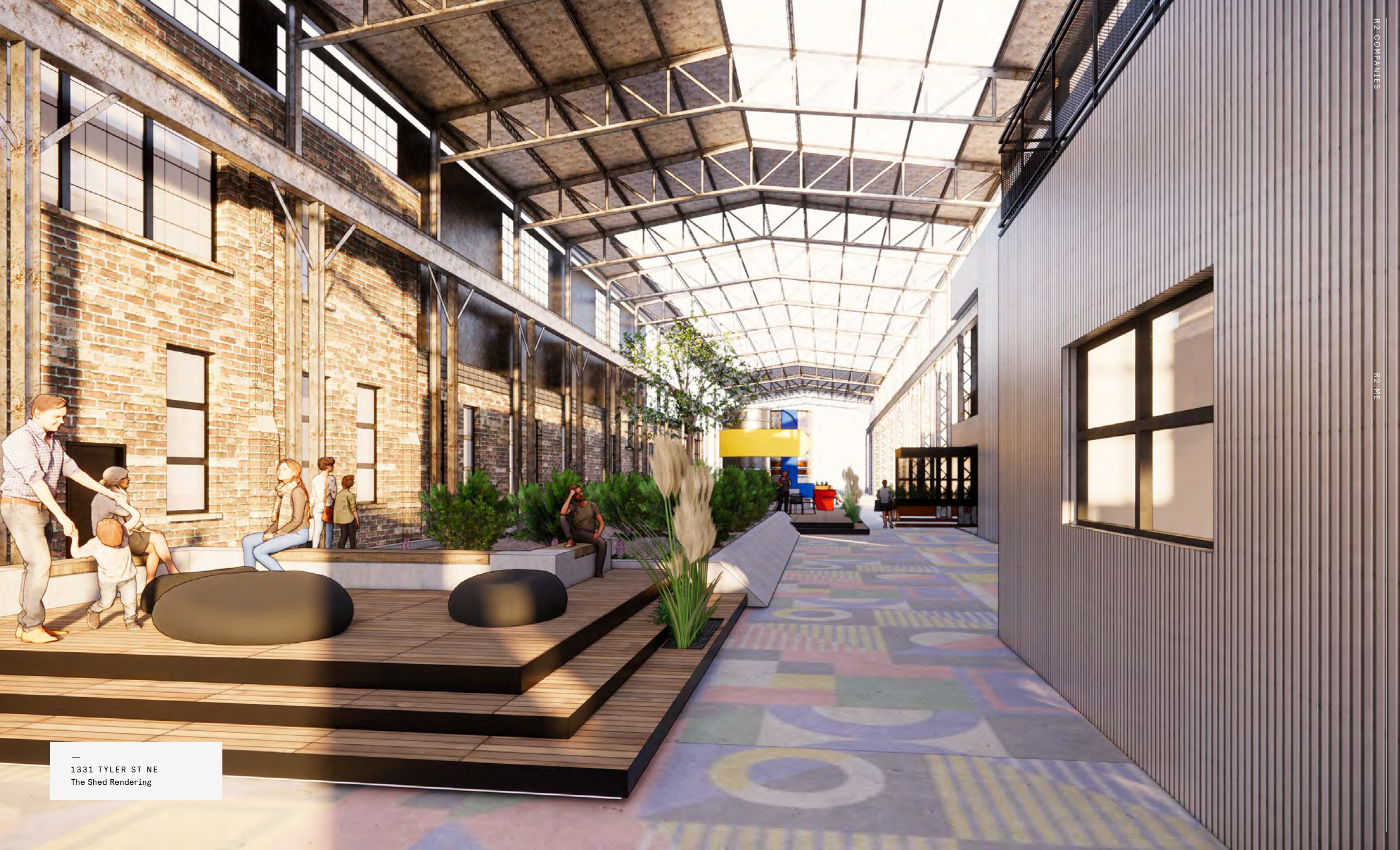
— 1331 TYLER ST NE The Shed Rendering