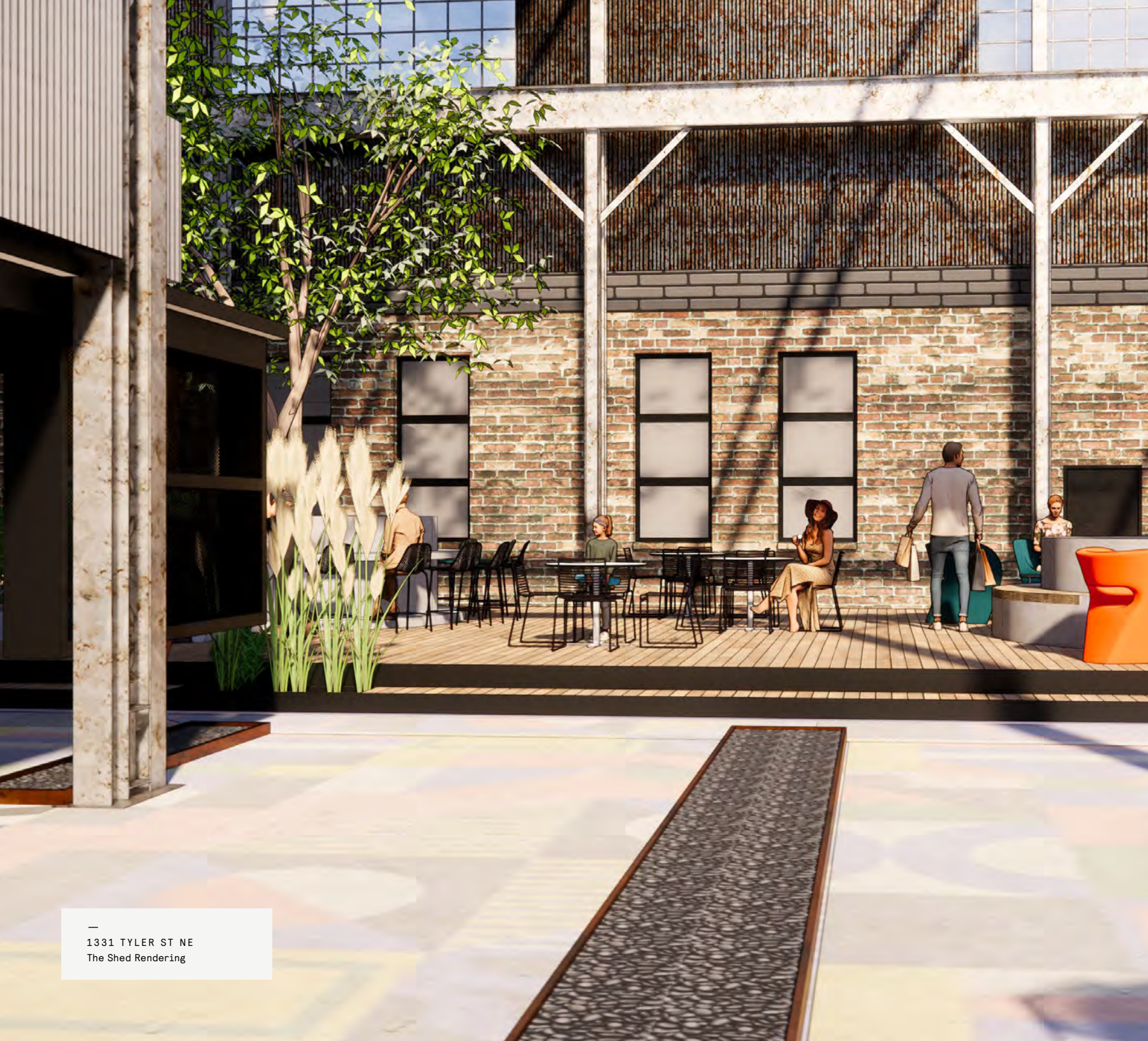
— 1331 TYLER ST NE The Shed Rendering