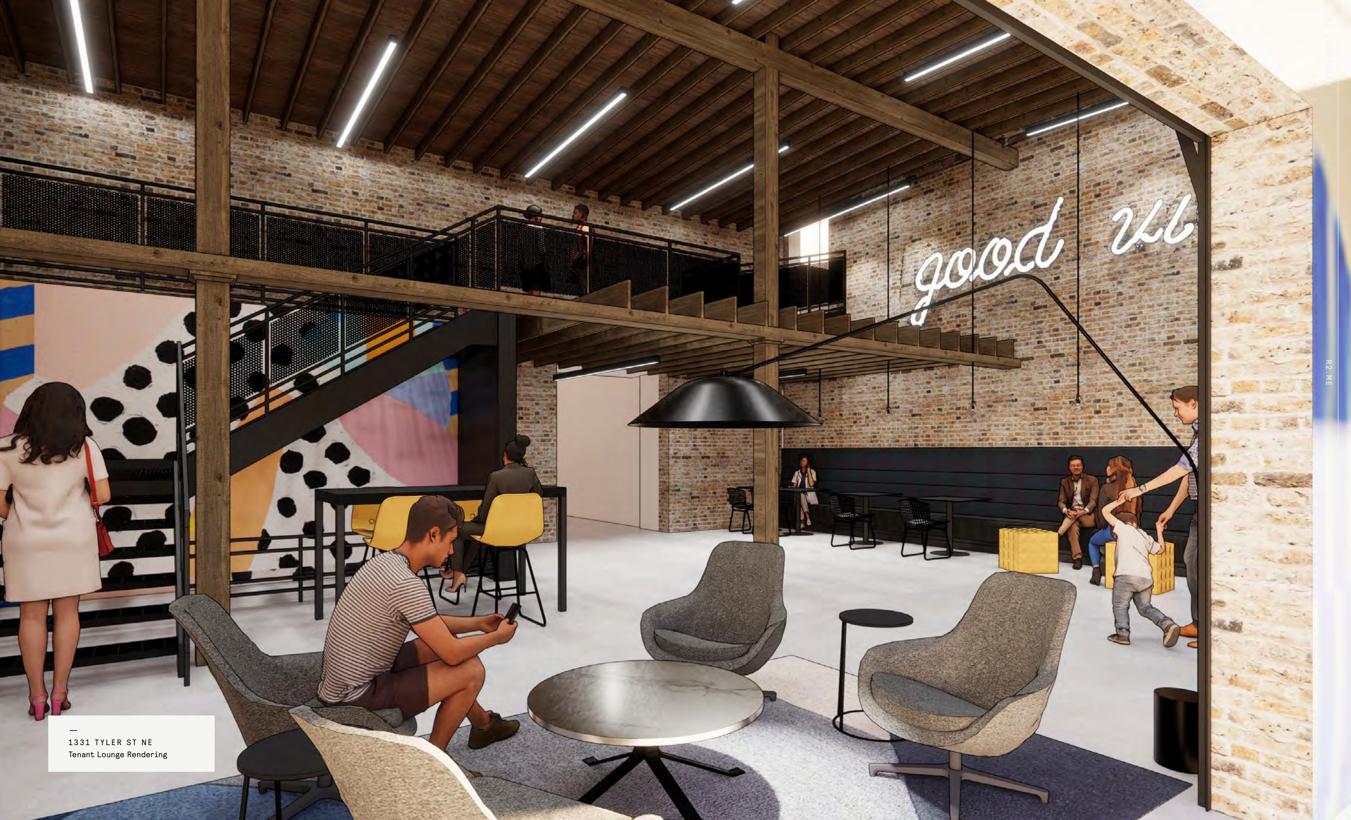
— 1331 TYLER ST NE Tenant Lounge Rendering