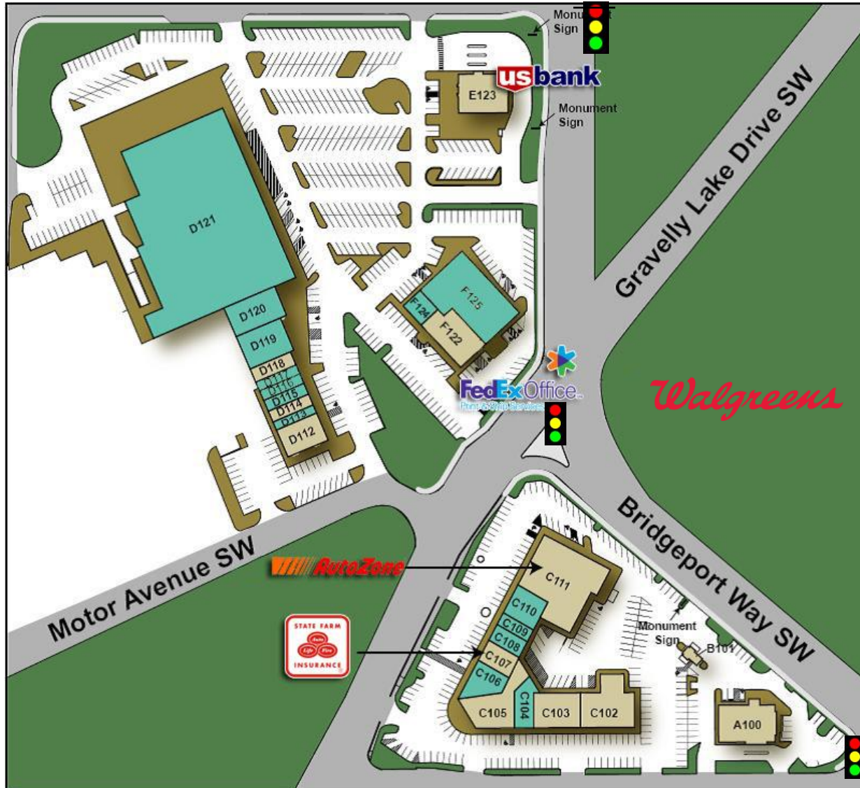
Site plan not to scale