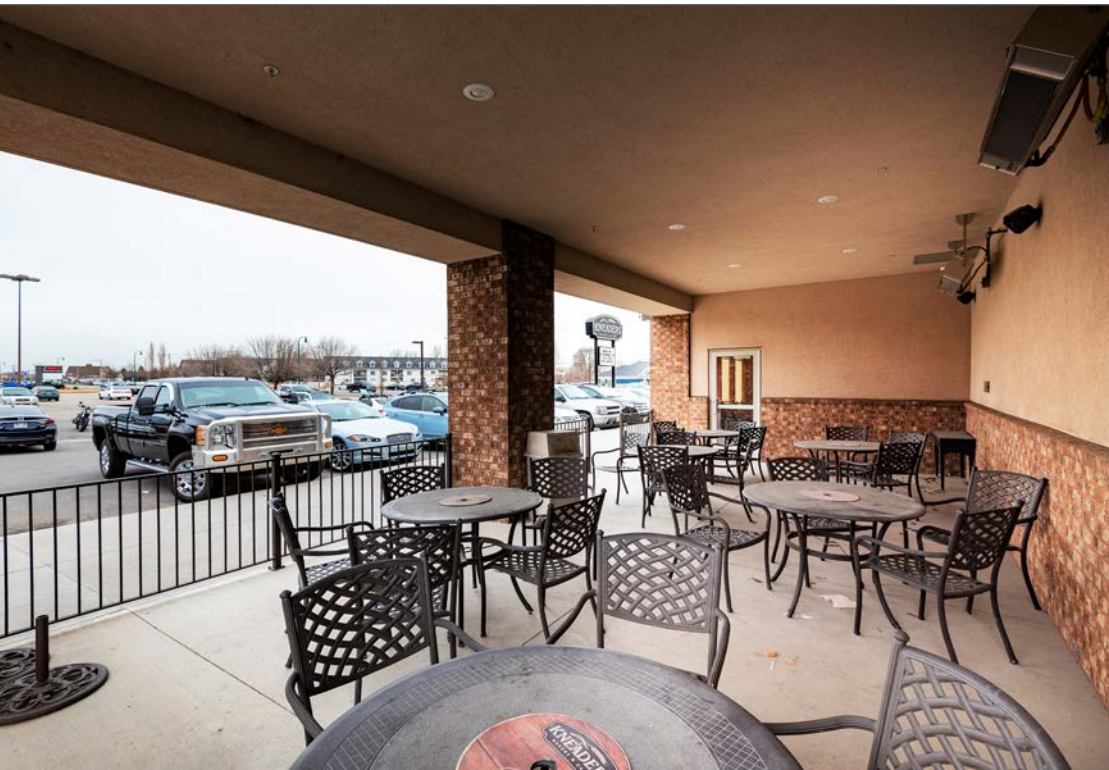
Outdoor Covered Patio