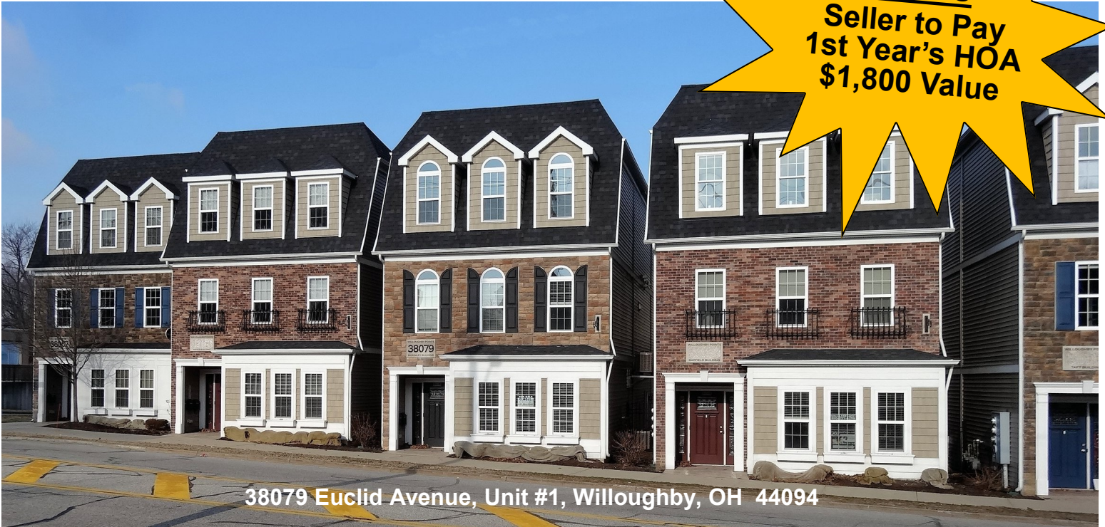
38079 Euclid Avenue, Unit #1, Willoughby, OH 44094