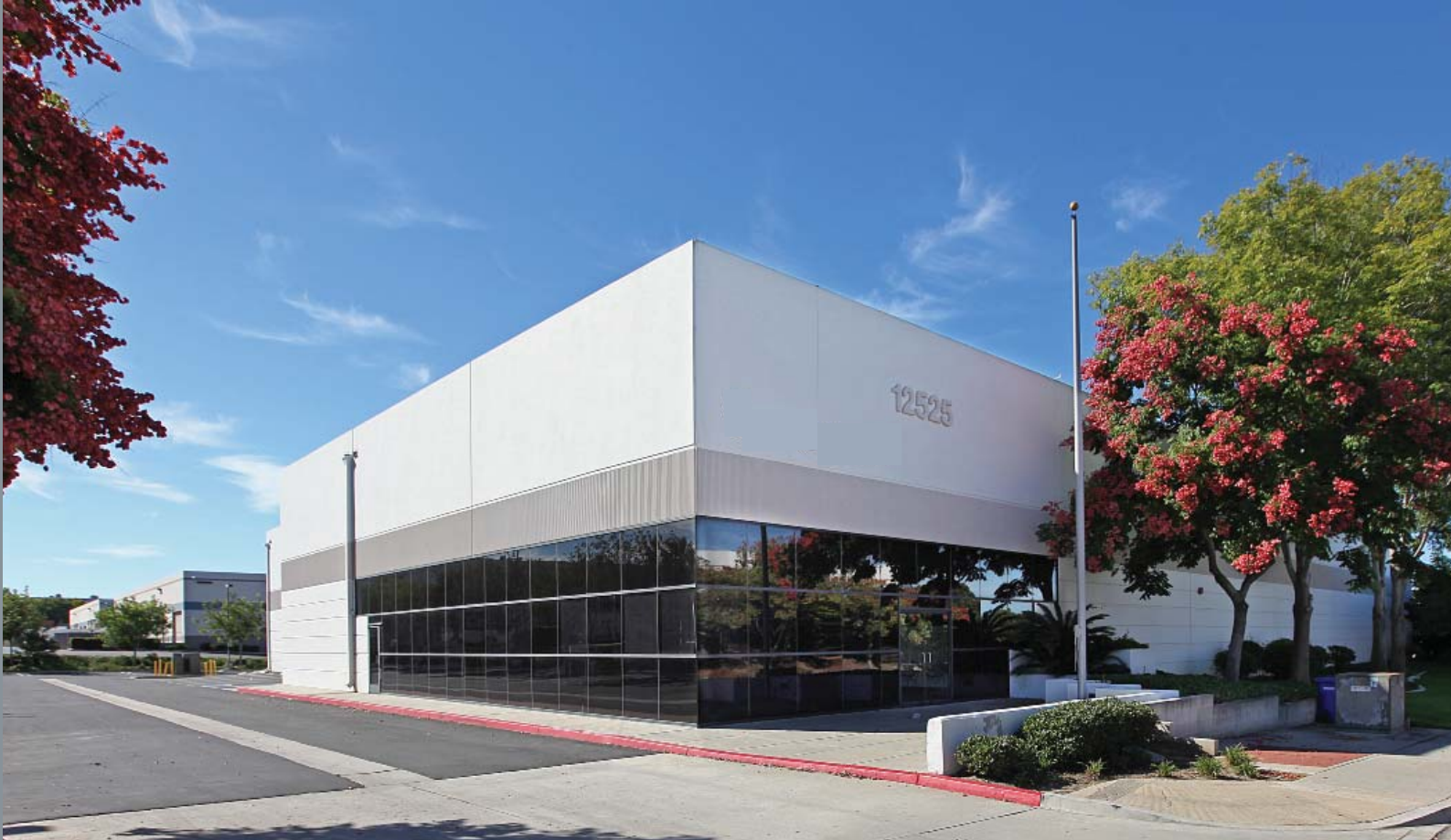
12525 Stowe Drive Poway California