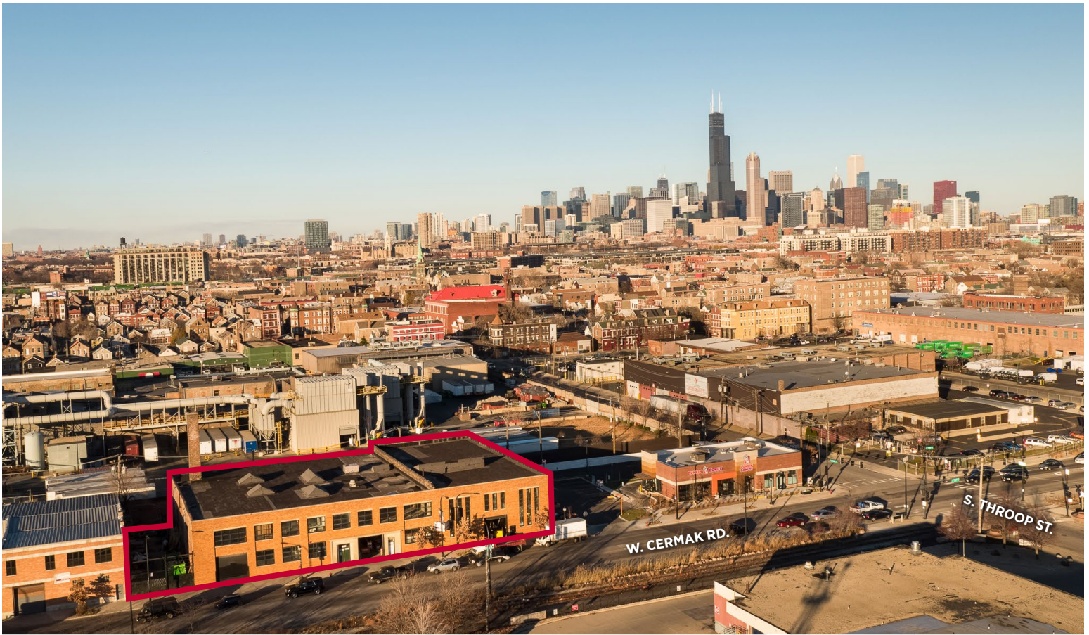
Subject Property Aerial Facing Northeast