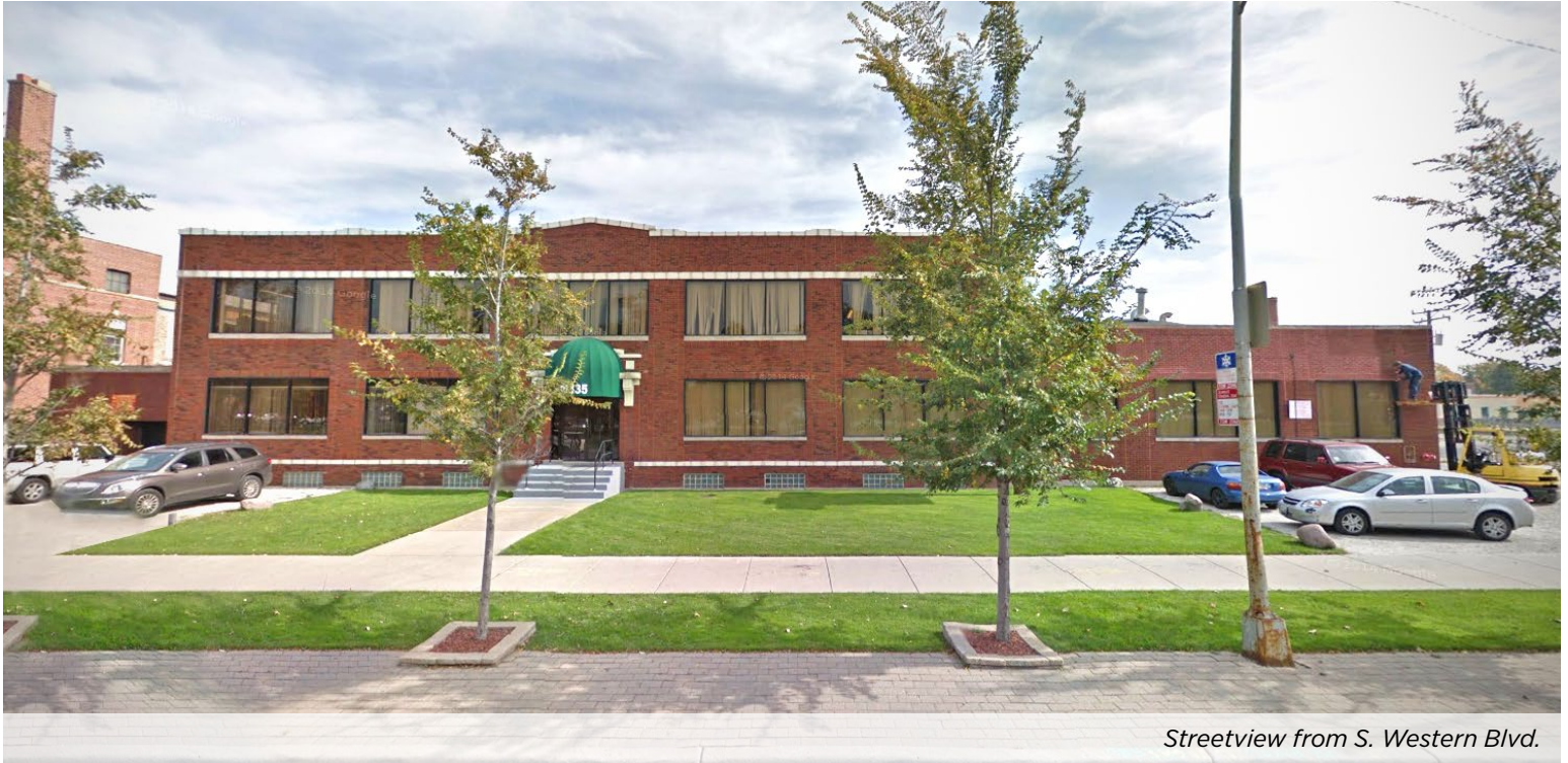
Streetview from S. Western Blvd.

5335 S. Western Boulevard CHICAGO, IL 60609