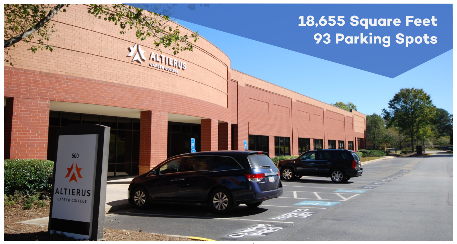
1750 Beaver Ruin Road, Suite 100 Norcross, Georgia 30093 Gwinnett Park - Northeast Atlanta