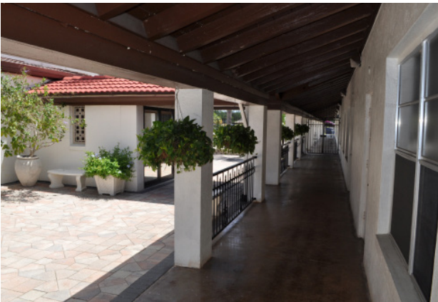
Courtyard - Classroom Walkway