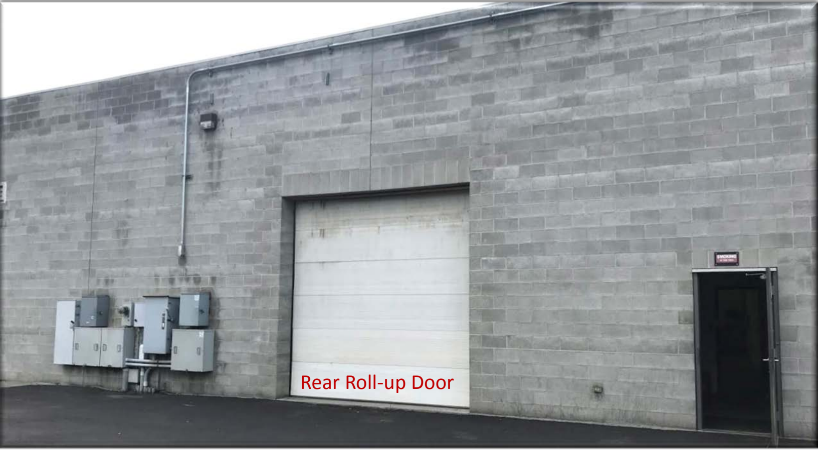
Rear Roll-up Door