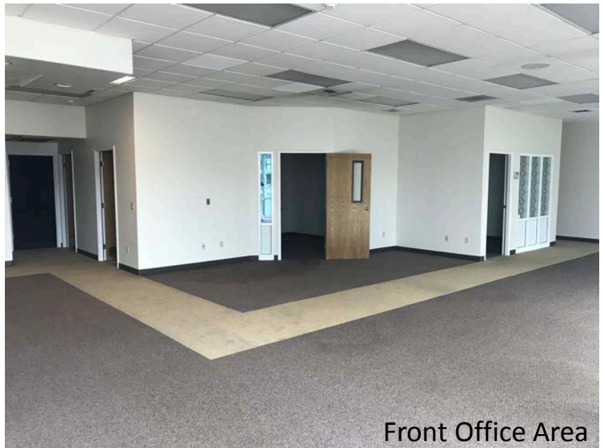
Front Office Area