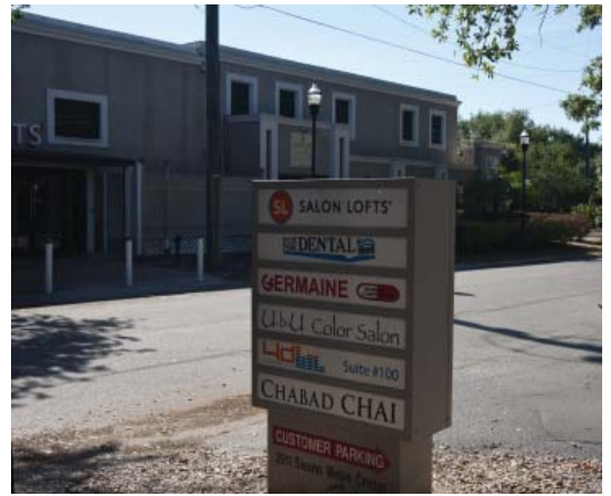
View of Parking Directory from Tampania