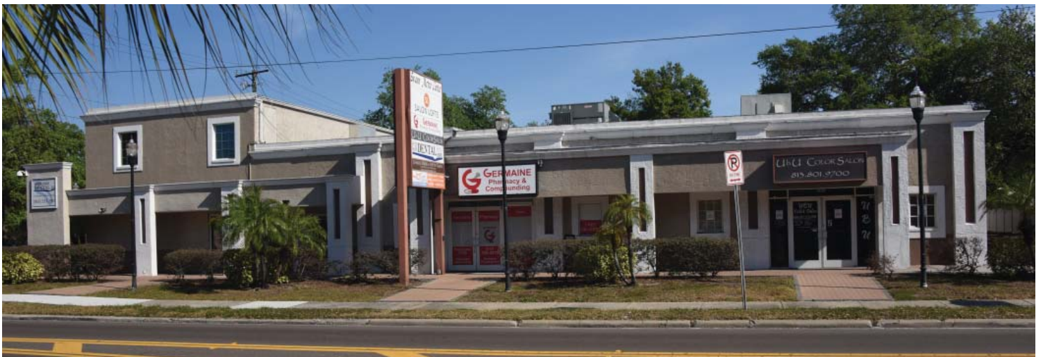
View From Swann Ave

Tenants Include: Salon Lofts, UBU Salon, Hyde Park Dental, Driven Training, & Chabad Chai