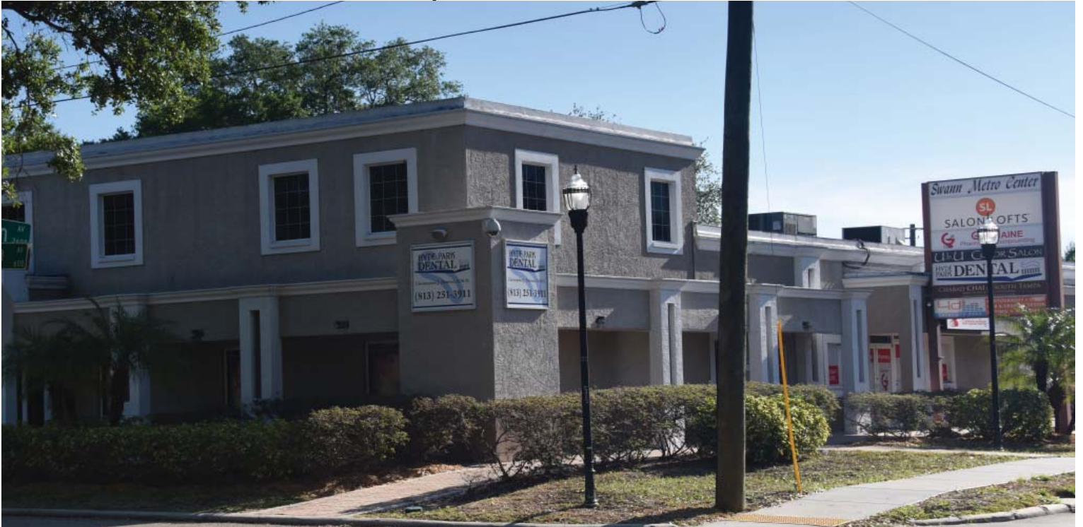
View From Swann Heading East

Retail, Medical, & Professional Office Complex in the Heart of Hyde Park, South Tampa 12,000 Sq Ft with Ample Parking