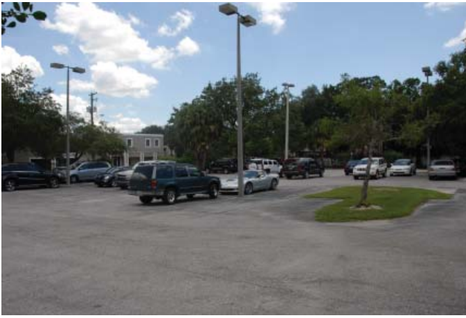
View of Prking lot