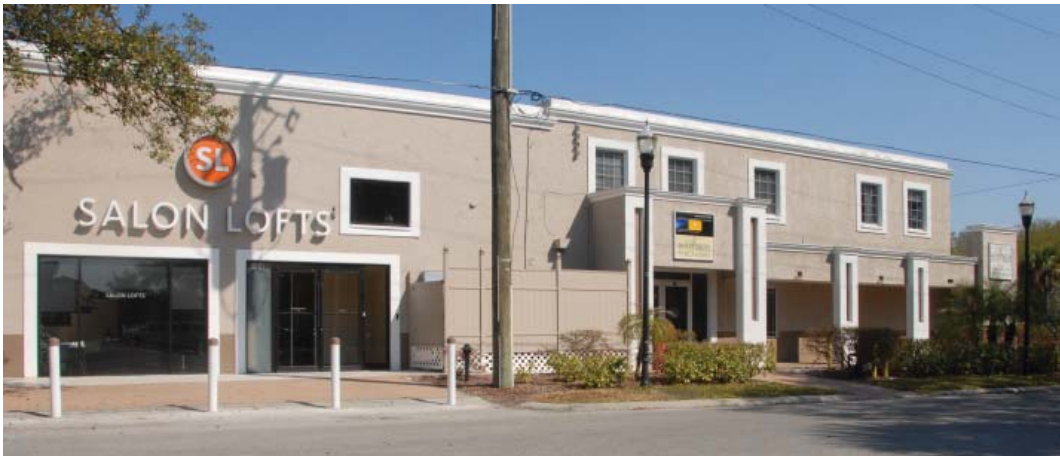
View from Tampania