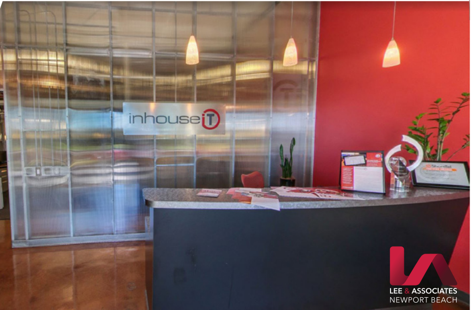
High Volume Space with Exposed Ceilings