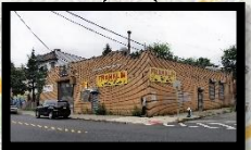
994 Stuyvesant Ave