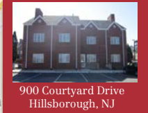
900 Courtyard Drive Hillsborough, NJ