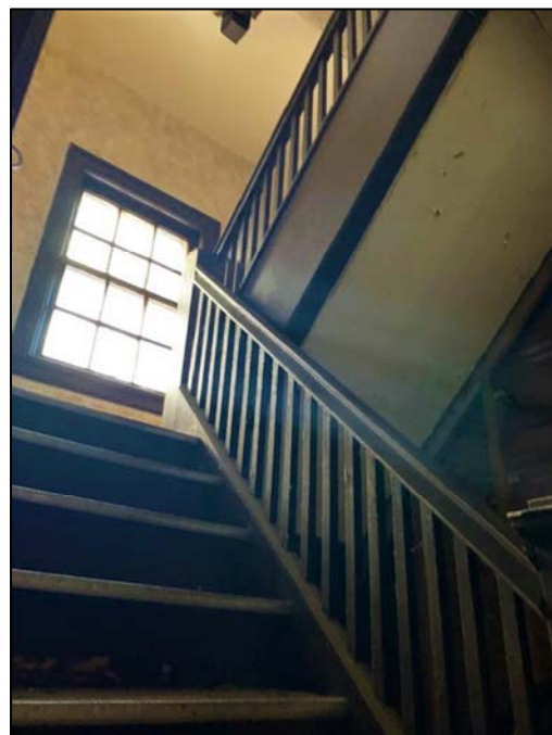
Original wood staircase