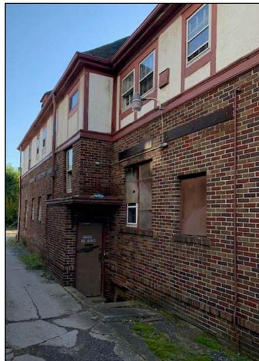
Brick & wood trim