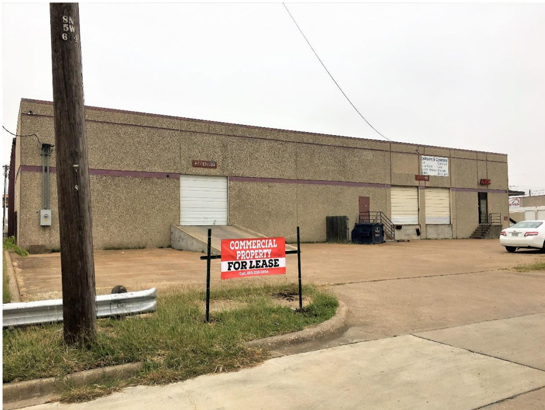
East side (front) view with "For Lease" sign