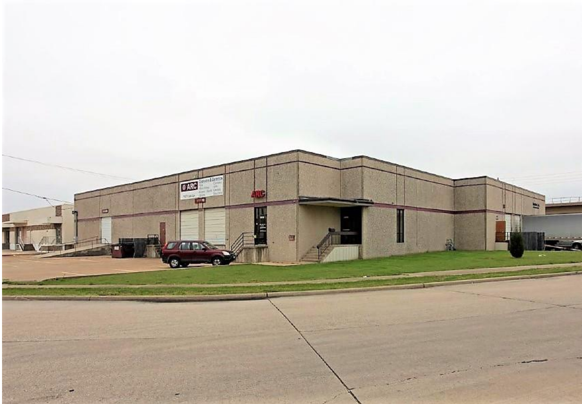
North and east sides of the warehouse