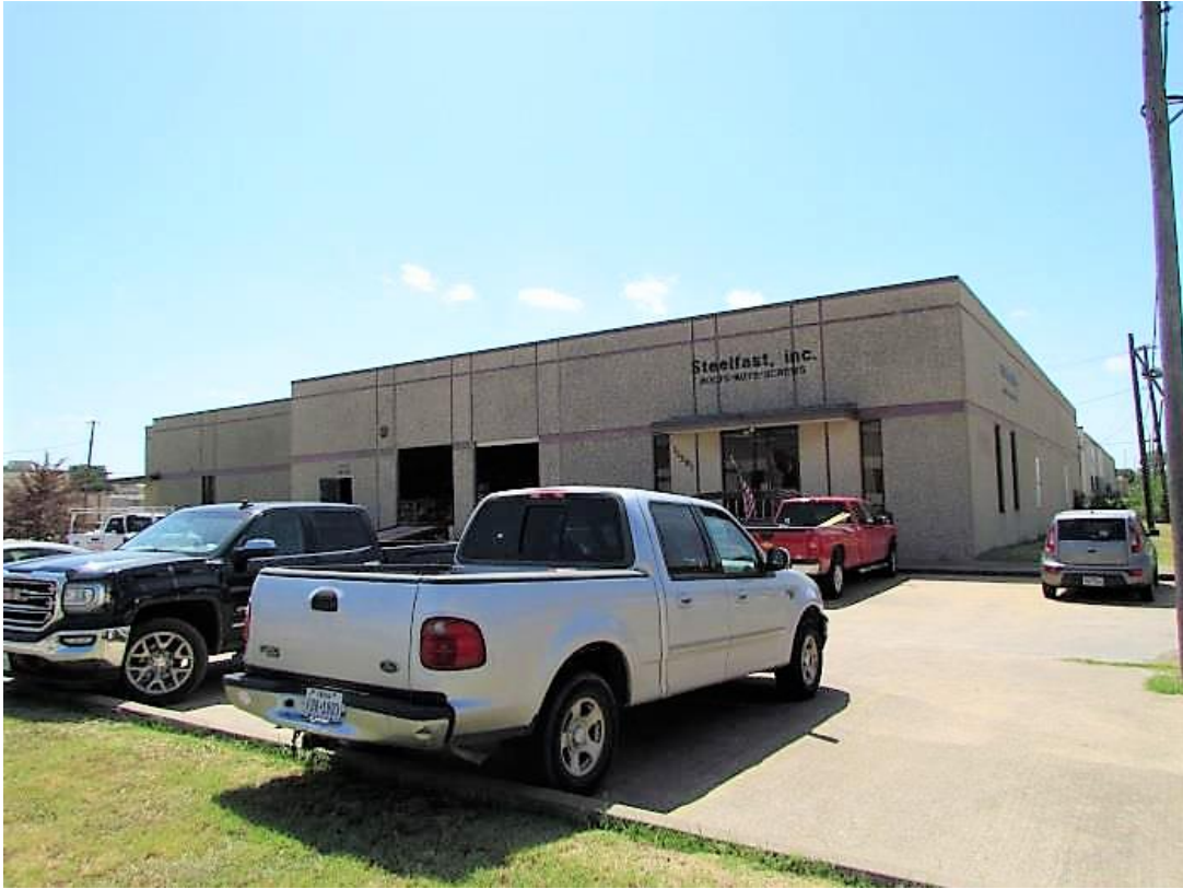
North side of the warehouse