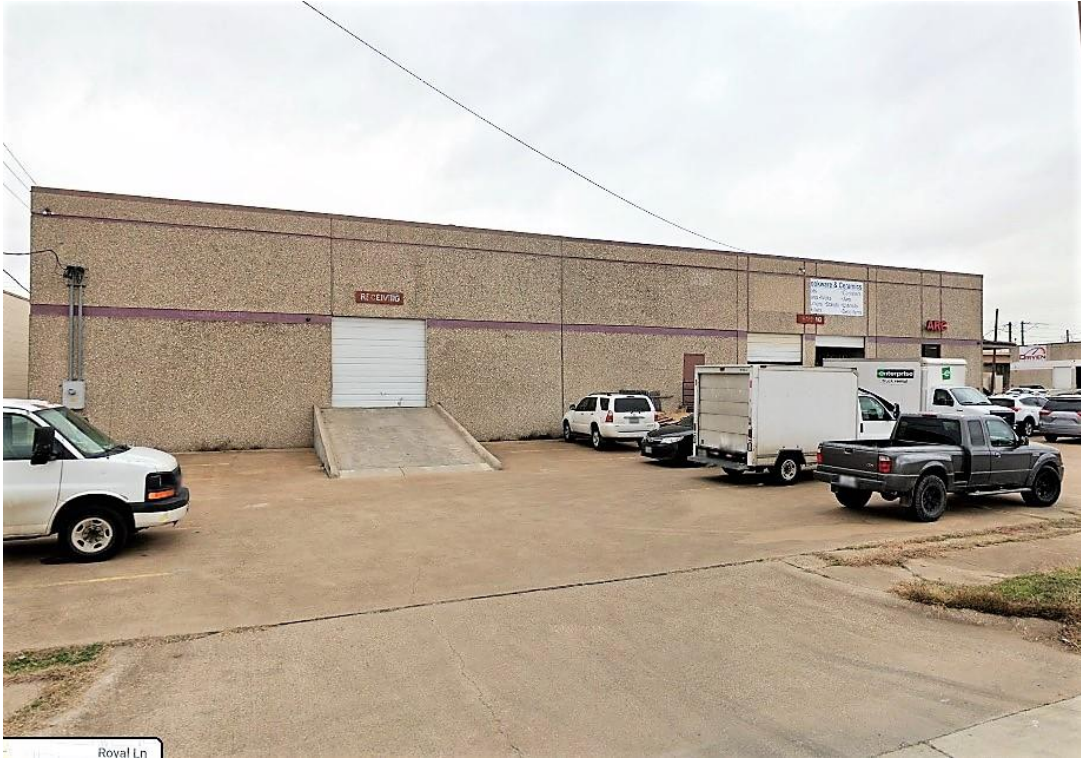
East side view showing ramp and parking lot