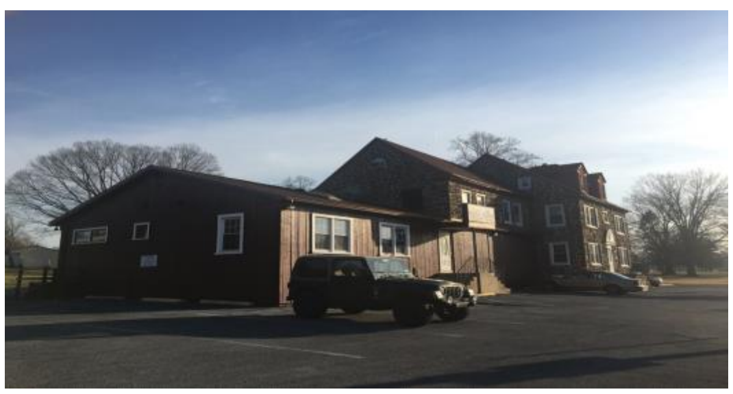
11W. SCHUYLKILL RD POTTSTOWN PA