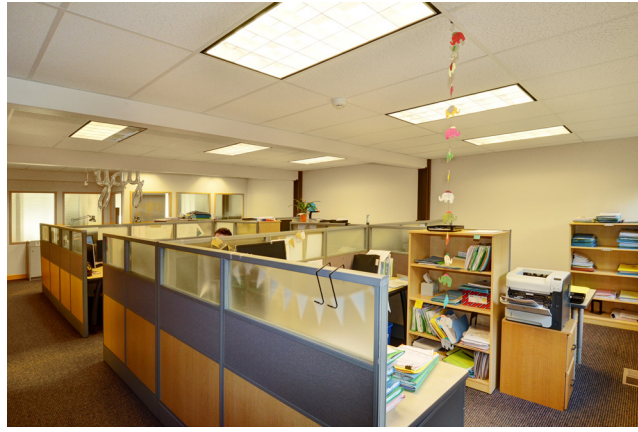
First floor: Open work area