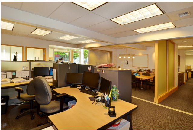
First floor: Open work area & conference room with sliding wall