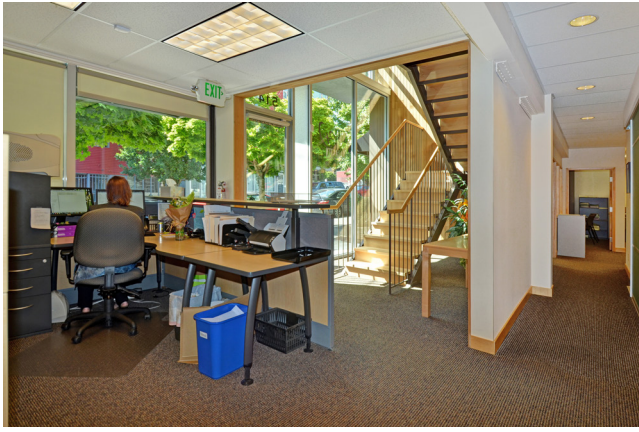
First floor: Reception area