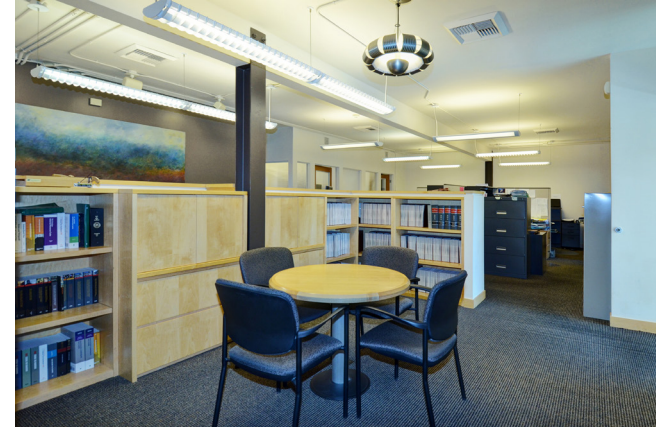
Second floor: Library & open work area