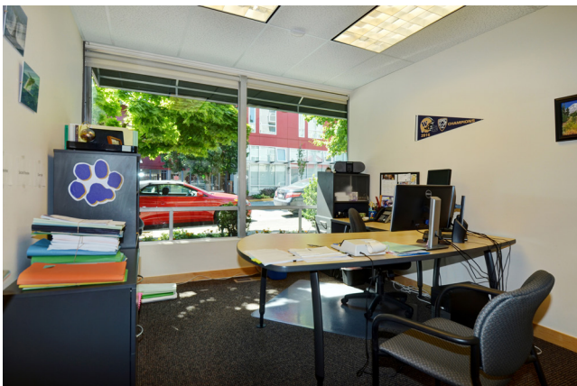
First Floor: Office