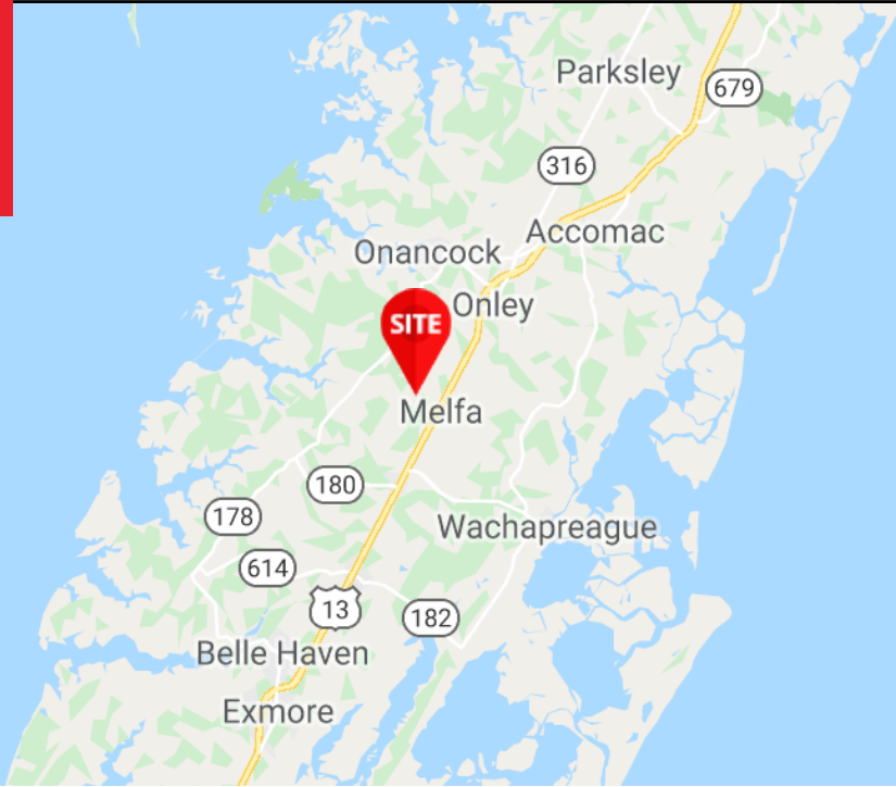
Map data ©2020