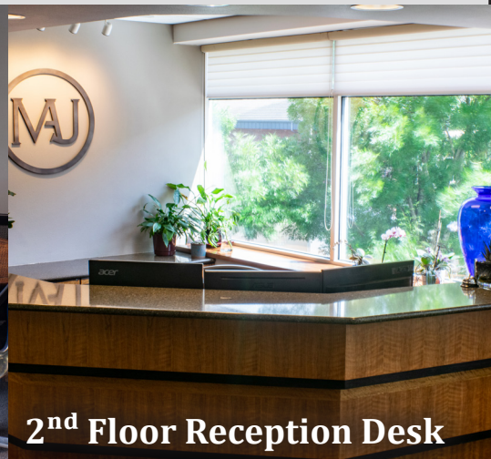
2 nd Floor Reception Desk