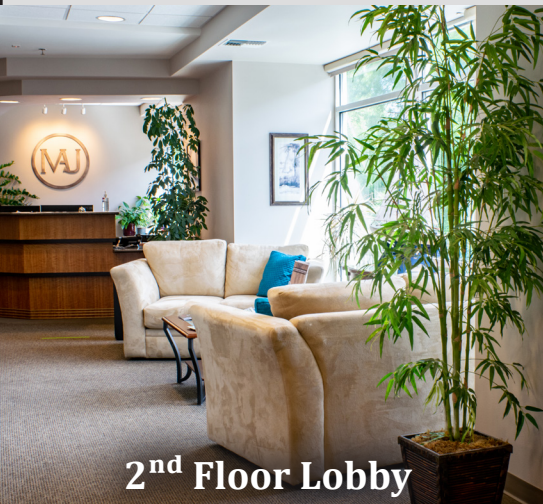
2 nd Floor Lobby