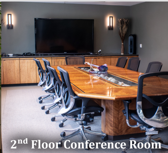
2 nd Floor Conference Room