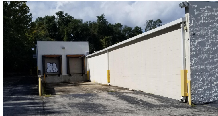
FROM TOP: Storefront // Interior // Loading Dock