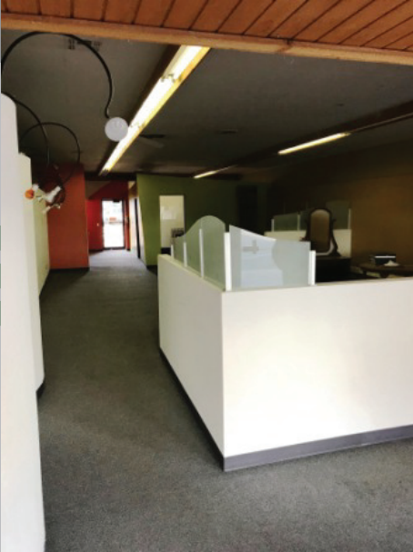
Interior Views from Front Door