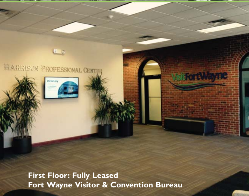
First Floor: Fully Leased Fort Wayne Visitor & Convention Bureau