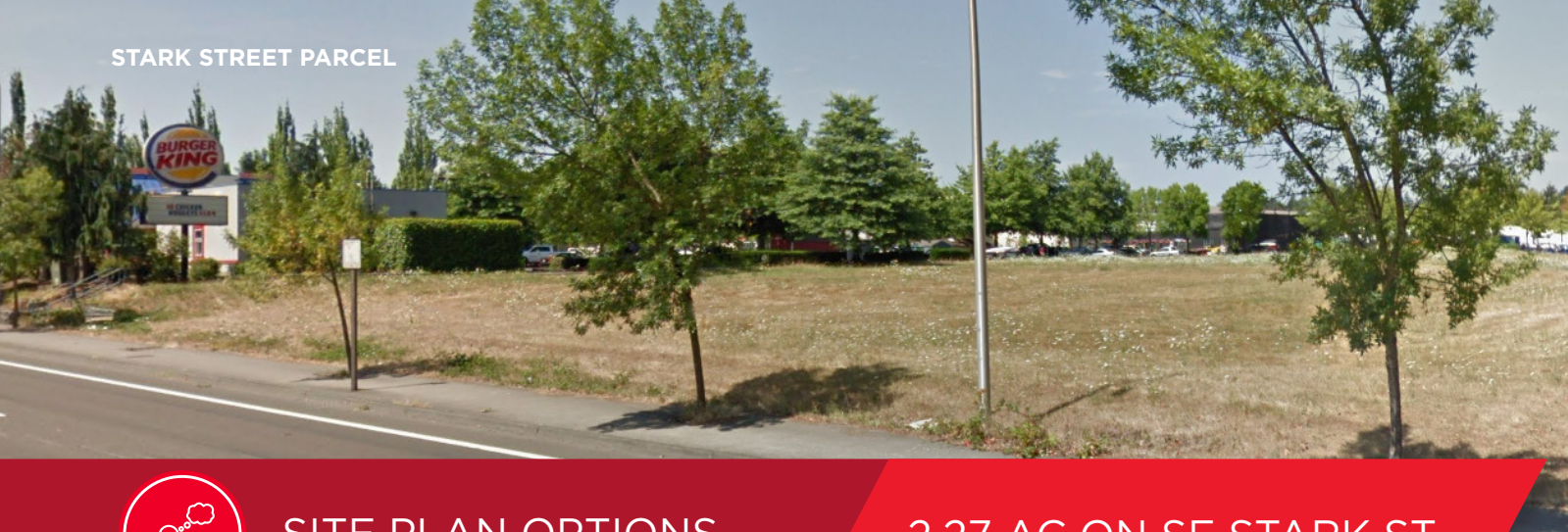
STARK STREET PARCEL