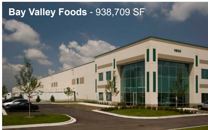
Bay Valley Foods - 938,709 SF