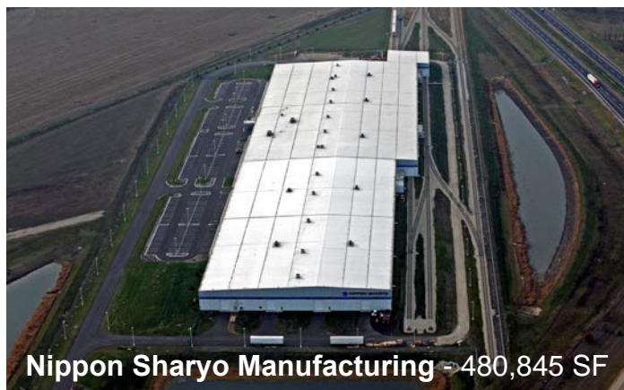
Nippon Sharyo Manufacturing - 480,845 SF