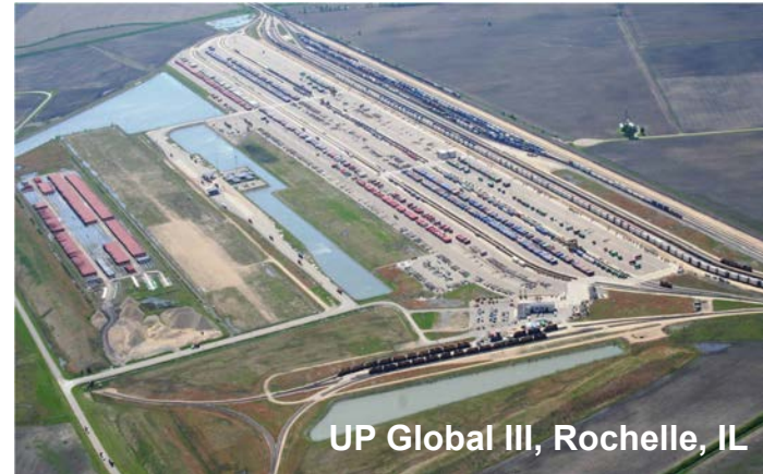
UP Global III, Rochelle, IL