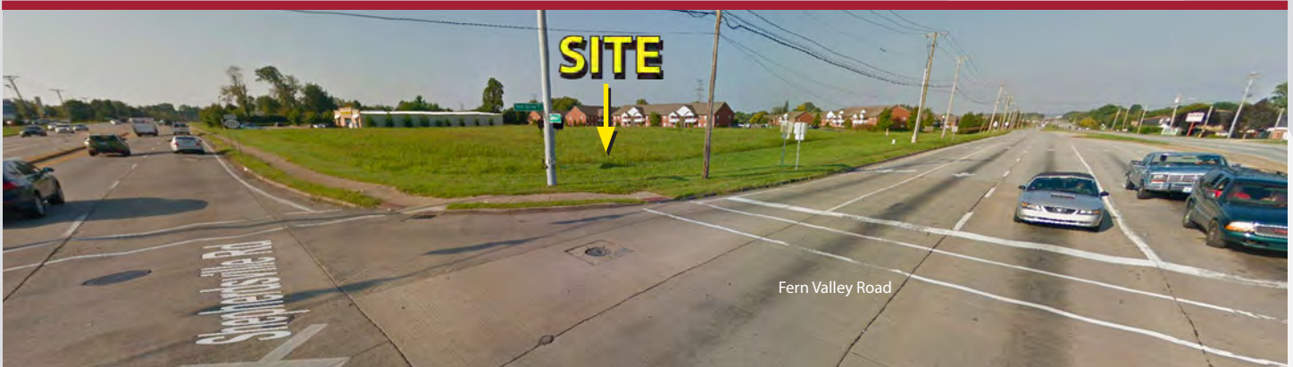
View looking southwest from intersection of Shepherdsville Road and Fern Valley Road