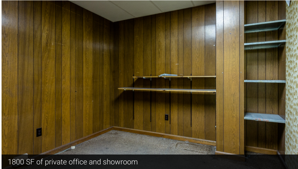
1800 SF of private office and showroom