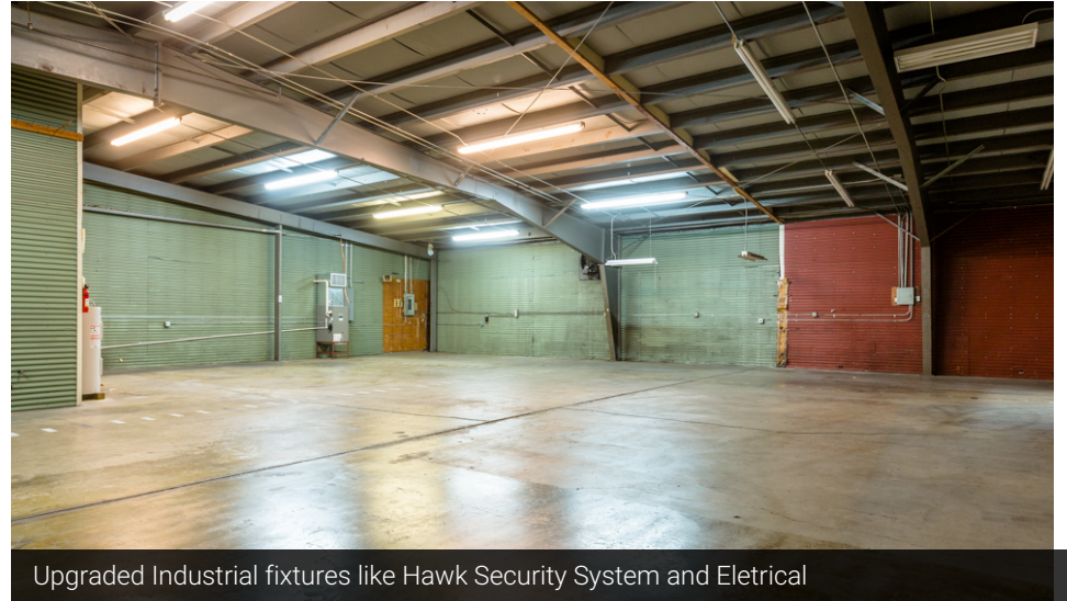
Upgraded Industrial fixtures like Hawk Security System and Eletrical