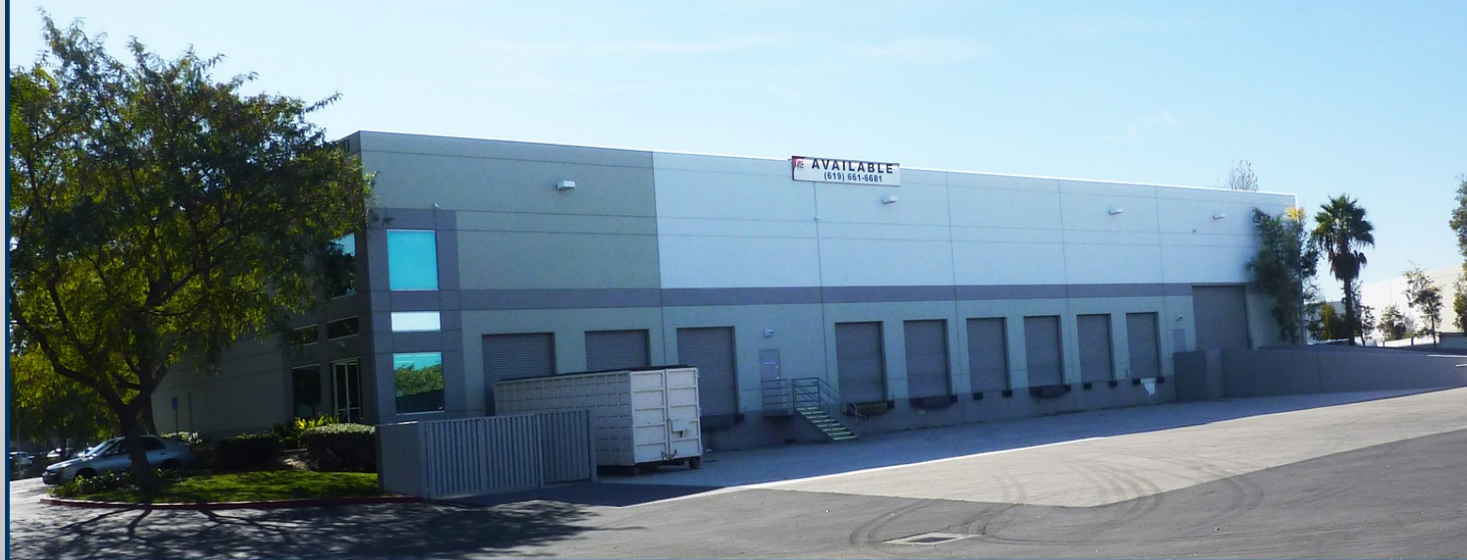
REAR VIEW OF FACILITY

2220 NIELS BOHR COURT, SAN DIEGO, CA 92154