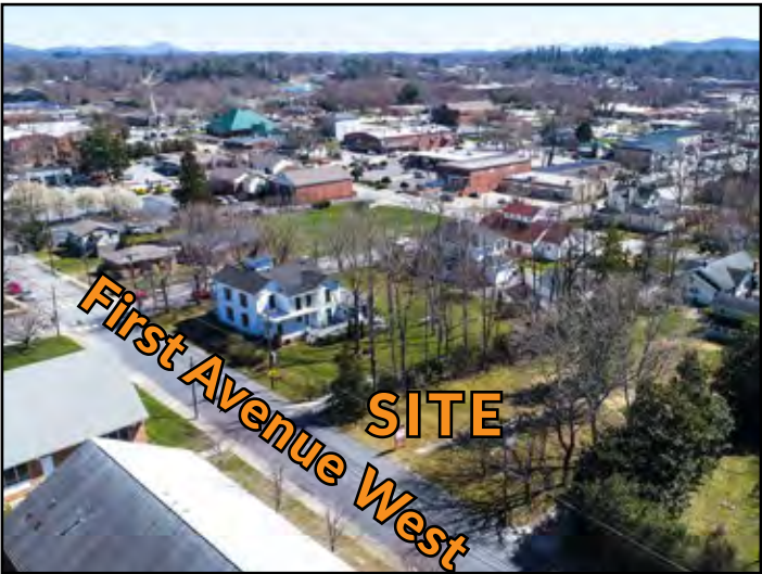
Aerial view looking south

Examples of R-6 District (High Density Residential District) projects are, but not necessarily limited to: Minor planned residential developments, single- and two-family dwellings, adult and child care homes (vs. centers), neighborhood community centers, parks, accessory dwelling units, and more. Some options require special permissions. Talk to Andrew Riddle about the variety of potential uses.