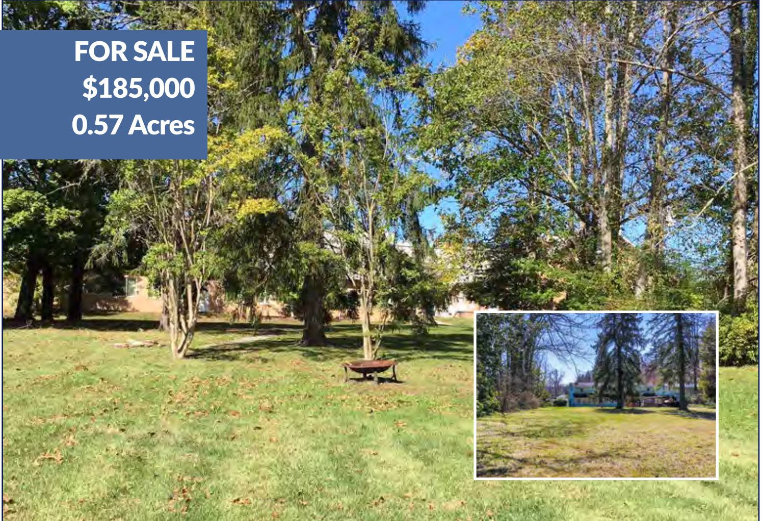
View looking toward First Avenue West; Inset: View looking from First Avenue West