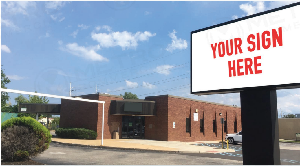
*DEMOGRAPHICS BASED ON A 5-MILE RADIUS