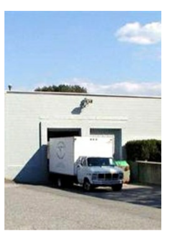
22 Pleasant Street

22 Pleasant Street, South Natick, MA 01760