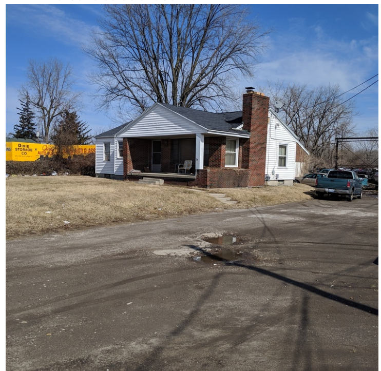
"Innovative Solutions at Work"