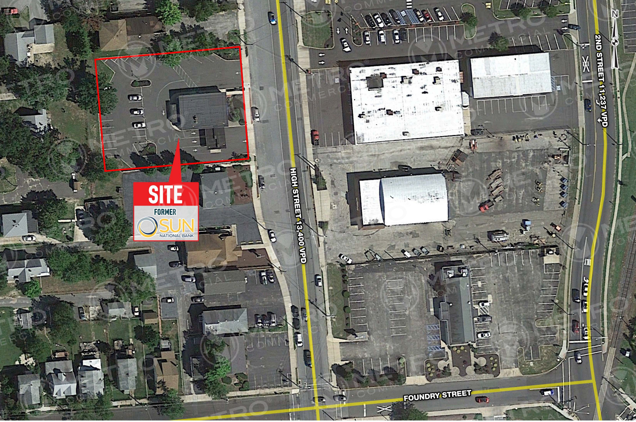
The information and images contained herein are from sources deemed reliable. However, Metro Commercial Real Estate, Inc. makes no representation whatsoever as to their accuracy or authenticity. Images shown may be modified for illustrative purposes. Images may be out-of-date and not current. 3.14