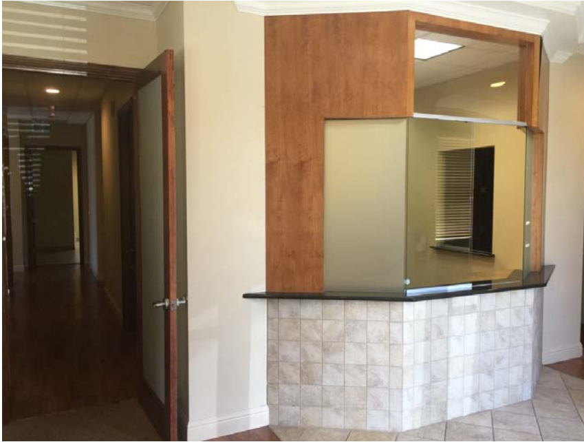
Lobby Entrance Admin Station