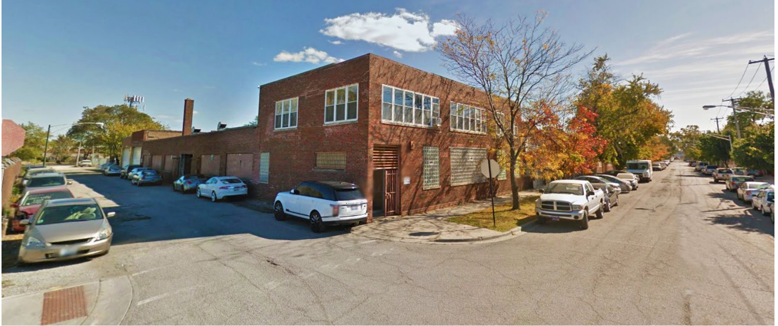
Corner Streetview from 57th and Claremont

5701-5721 S. Claremont Avenue CHICAGO, IL 60636