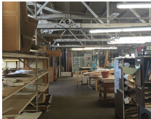
Flex Warehouse Space