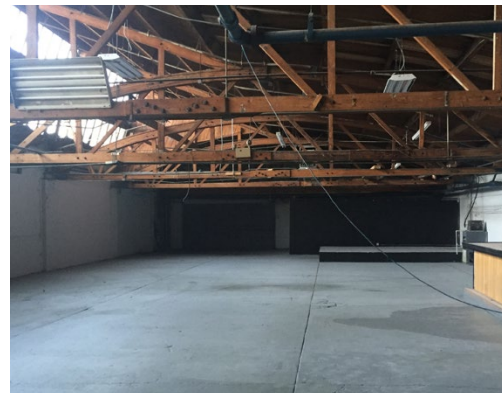
Barrel Truss Warehouse