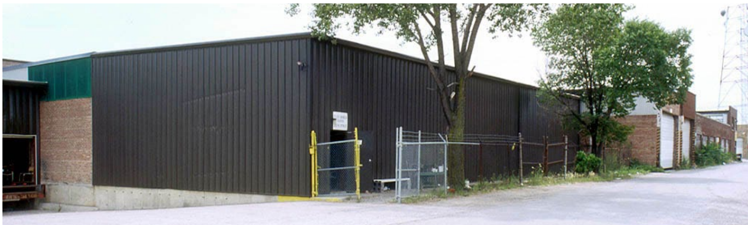
Streetview from W. 57th St.