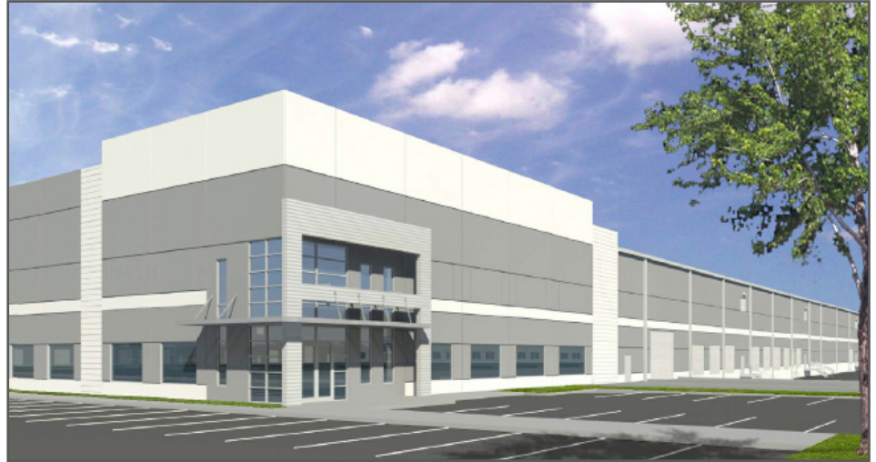
Sample Building Image